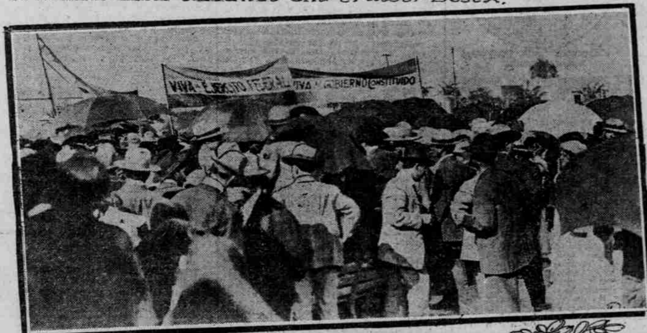
Mass Meeting in Torreon Before Capture by Villa

It's a little bit too early in the season to say that the varsity crews are perfect, but those who know, claim that the men are advancing rapidly.