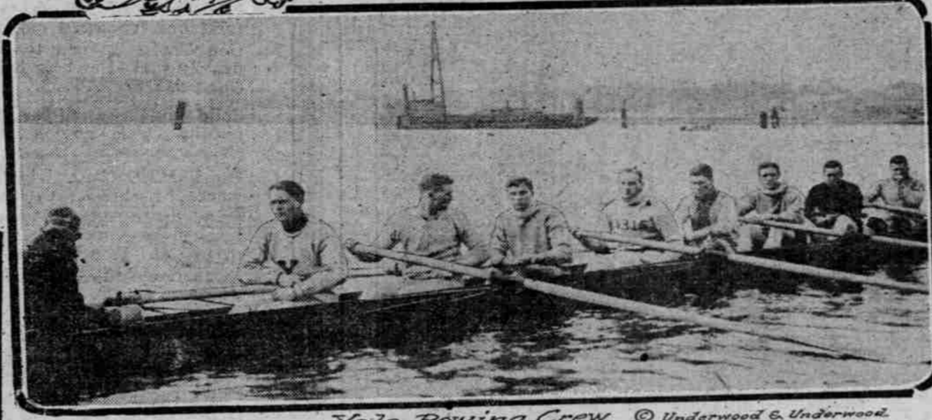
Yale Rowing Crew

It's a little bit too early in the season to say that the varsity crews are perfect, but those who know, claim that the men are advancing rapidly.