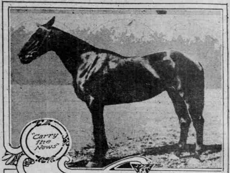
Carry the News