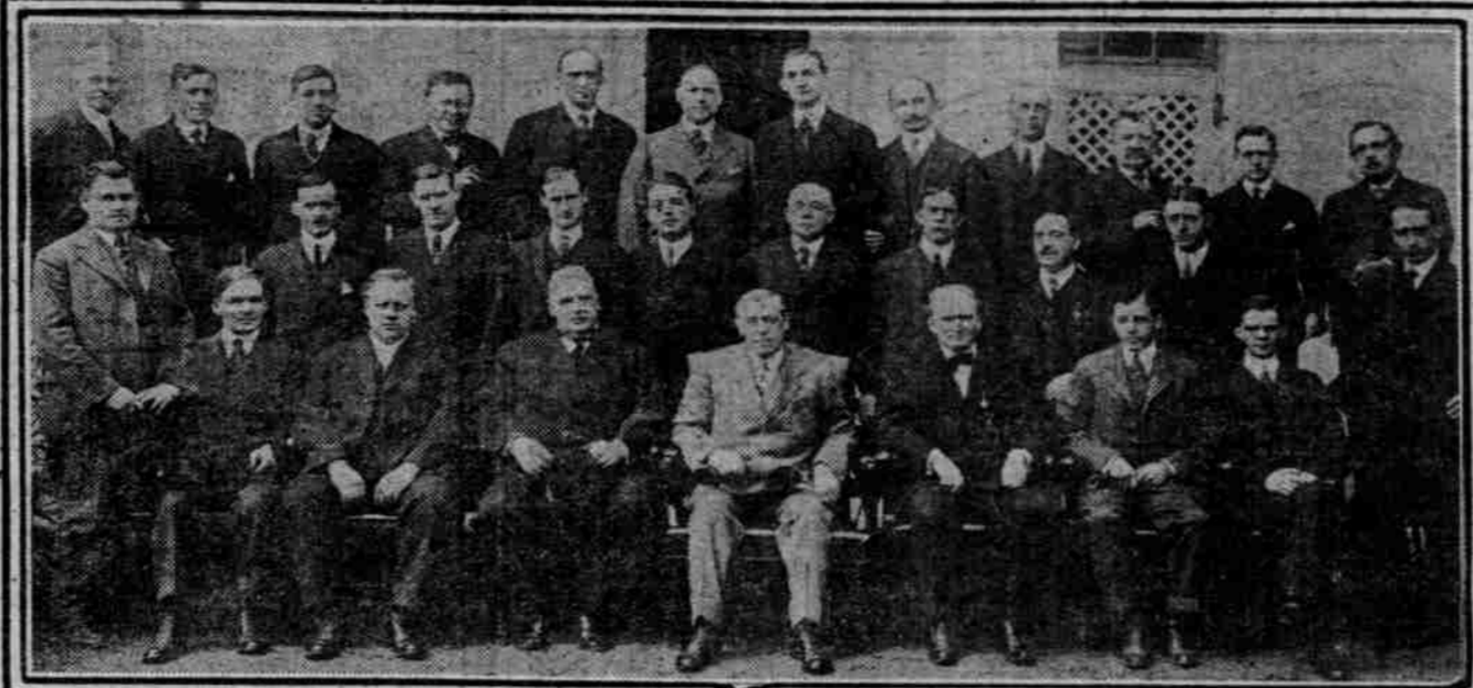
President Wilson and the Men who Send the News from Washington