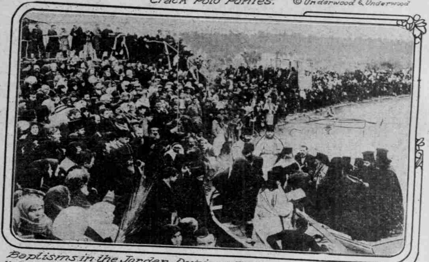
Baptisms in the Jordan During Easter Week.

The world's greatest polo ponies, as H. P. Whitney calls them, are now engaged at Georgian Court, George Gould's country residence at Lakewood, N. J.