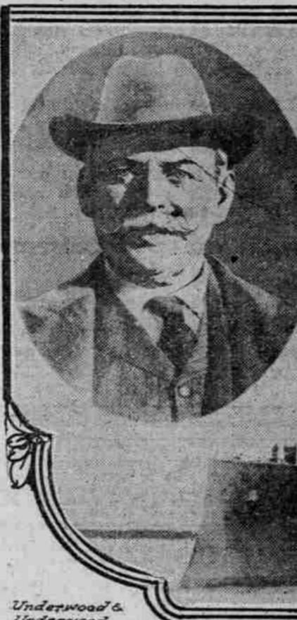
British Minister to Mexico and Cruiser Essex.