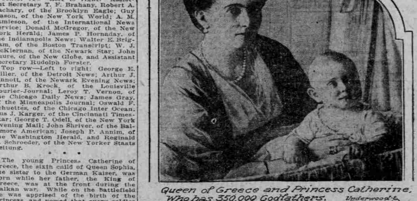
Queen of Greece and Princess Catherine, Who has 350,000 Godfathers.

Ten feet were cut from the colossal smokestacks of the Emperor at Hamburg recently, and other extensive alterations made on her upper works.