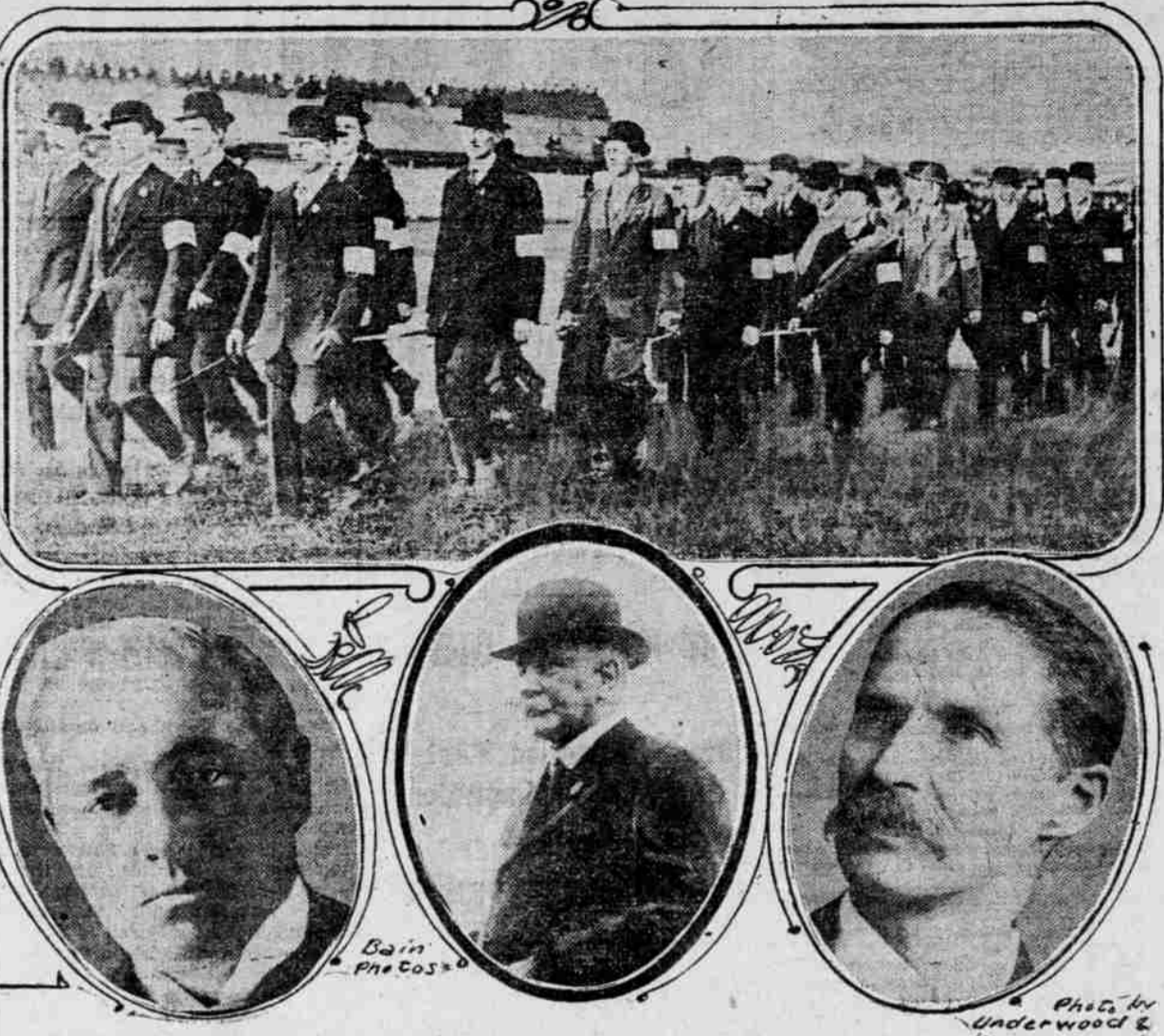
Top—Ulster Volunteers on March. Below, Left—Ronald McNeill, M. P. of County Antrim, Who is Prominent in Controversy; Center—General Sir George Richardson, Commander Ulster Volunteers; Right—Andrew Bonar Law, Opposition Leader in Commons.