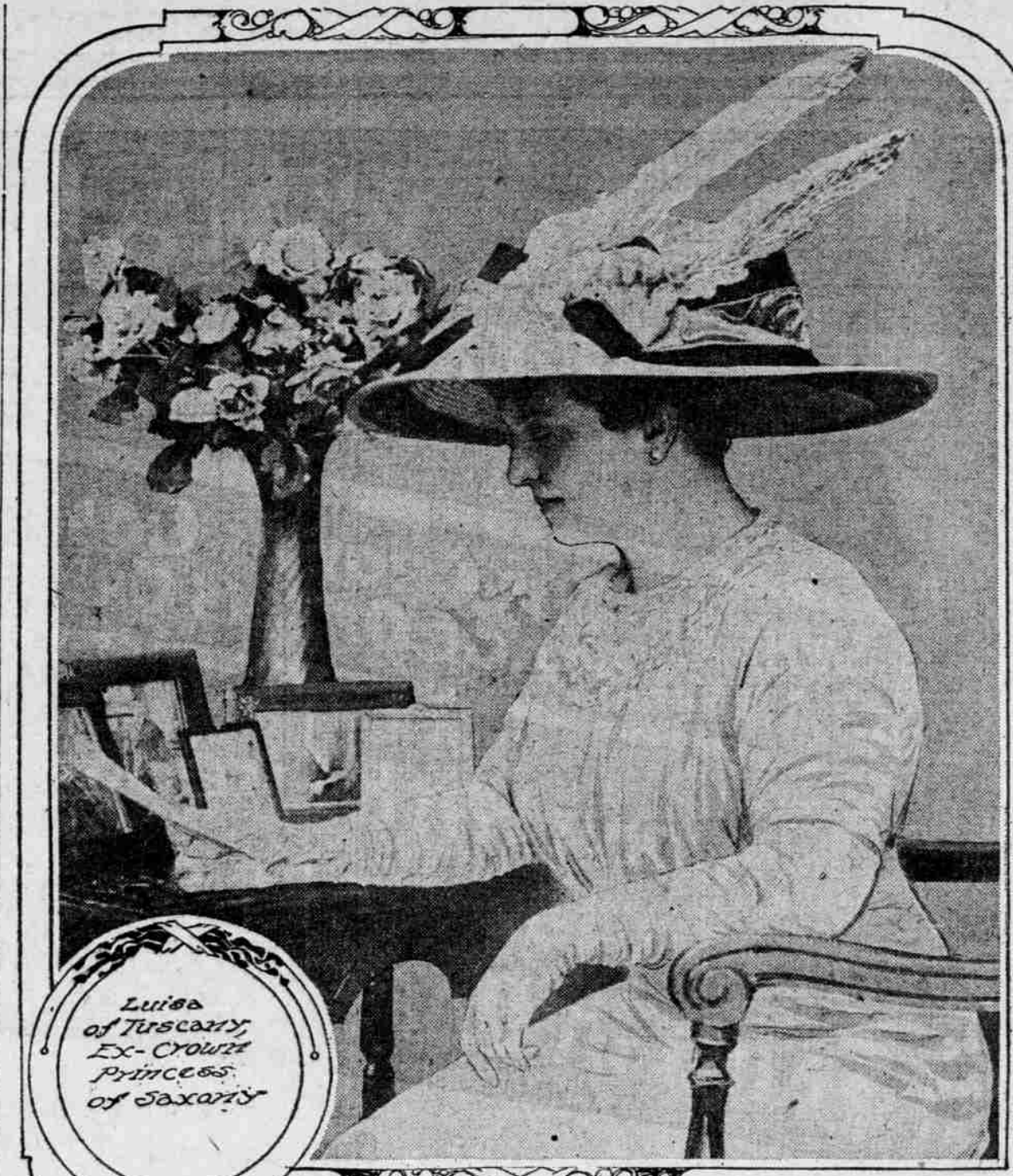
Luisa of Tuscany, Ex-Courtesan of Saxony