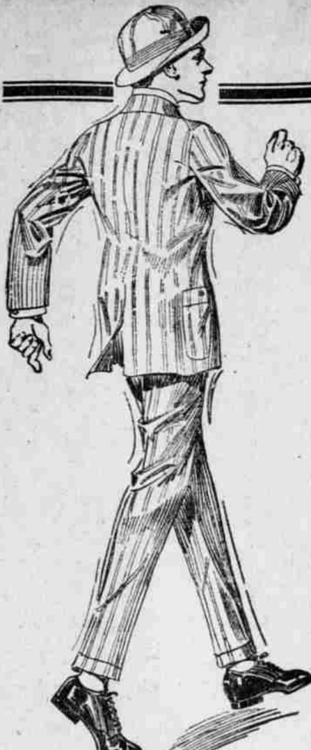
New Hats, Shirts Ties, Etc. for Spring

WASHINGTON, March 14.—The declaration of General Carranza, outlining his policy as to the right of American Consuls in Northern Mexico to act as citizens of other powers, was transmitted today to the various powers by the diplomatic representatives in Washington.