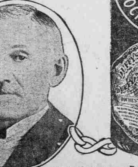
Reduced fac-simile of bottle.