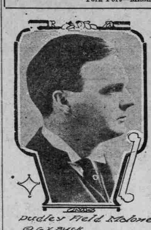
Dudley Field Malone