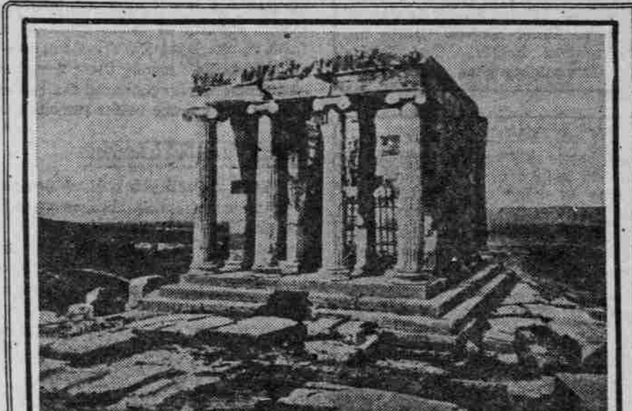
The Temple of Athena Nike, Near Athens, from "The Critics."