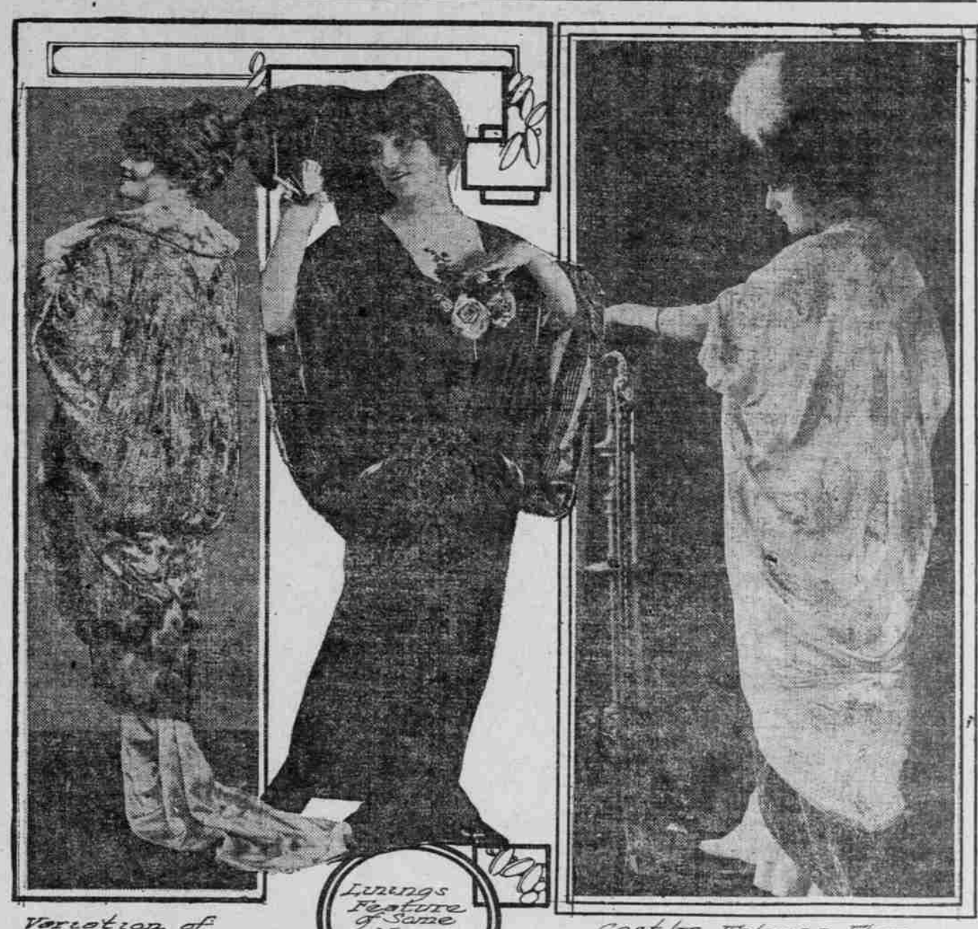
Variation of Moleskin Wrap

Some of New Outer Garments for Women Conspicuous for Seemingly Careless Manner of Make—Drapery Distinctly Oriental in Suggestion—Soft Grays of Moleskin Are Favorites With Persons of Taste.