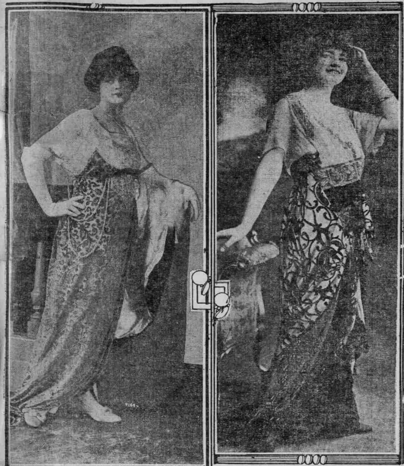
Opera Gowns of American Beauty Brocade

Pluffy Chiffons and Nets Selected for Gay Dancing Frocks—American Beauty Brocade Handsome With Combination of Velvet, Pearl and Rhinestone Trimmings, With Graceful Bodice—Waist Lines Out of Fashion.