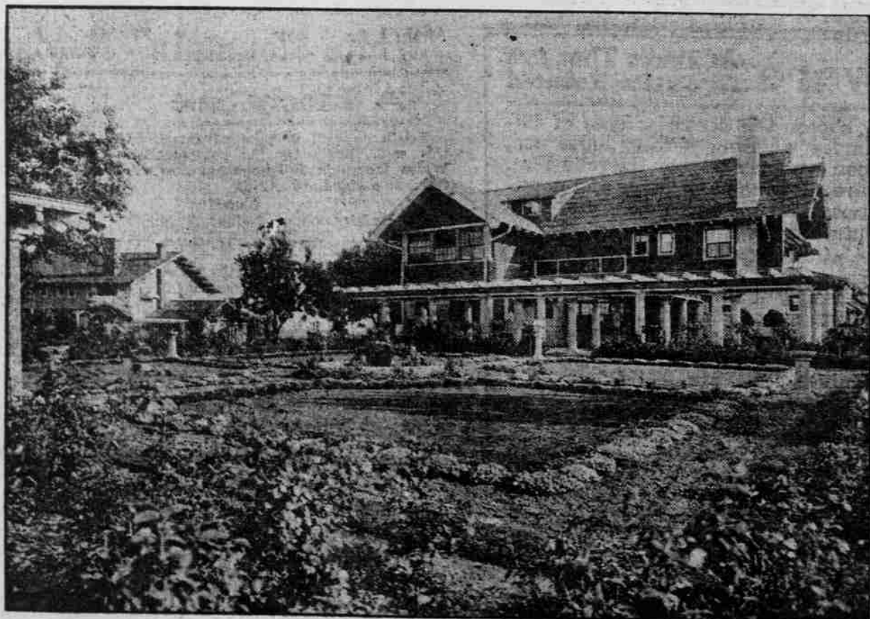
VIEW OF GARDEN AND PERGOLA.