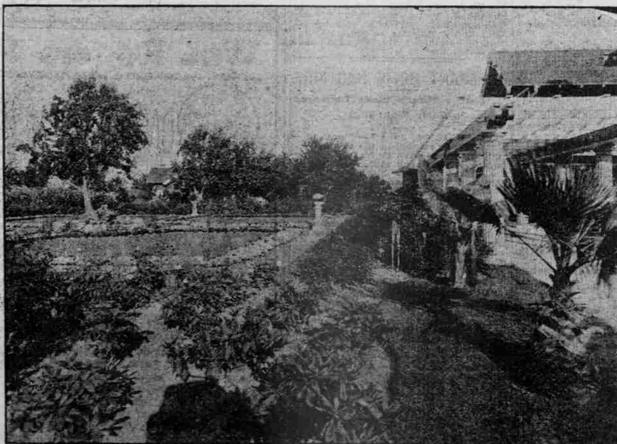
END VIEW OF PERGOLA.