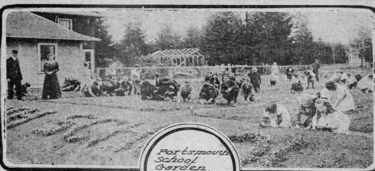
Portsmouth School Garden, Turning The Rows

Portsmouth, Holladay, Brooklyn, Buckman and Woodlawn Schools and Several Others Have Their Plots of Ground in Which Busy Workers May Be Seen Early and Late, Flying Spade and Rake.