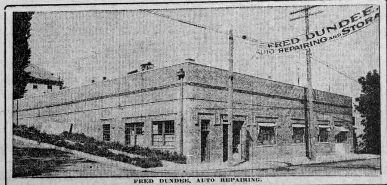
FRED DUNDEE, AUTO REPAIRING.