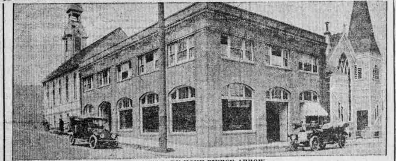
TEMPORARY HOME PIERCE-ARROW.