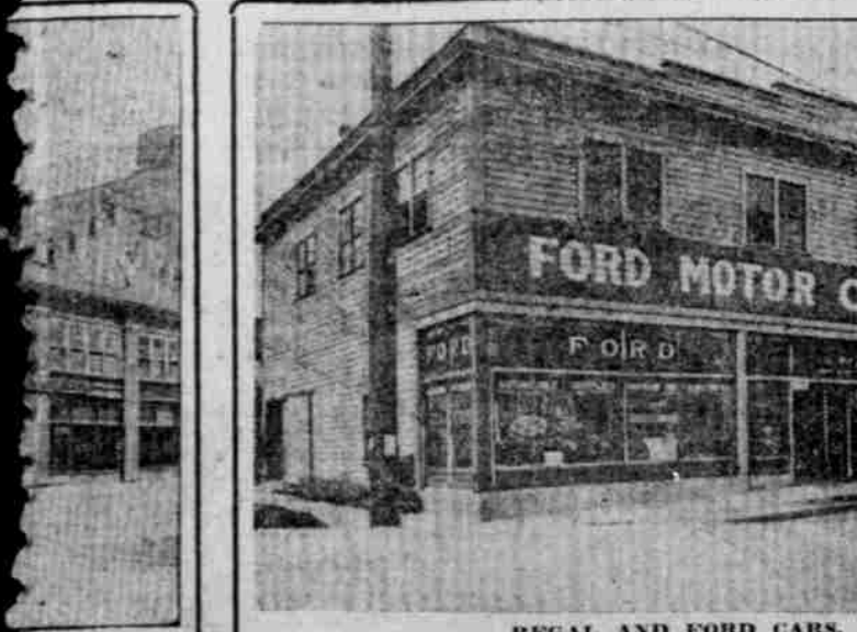
REGAL AND FORD CARS.