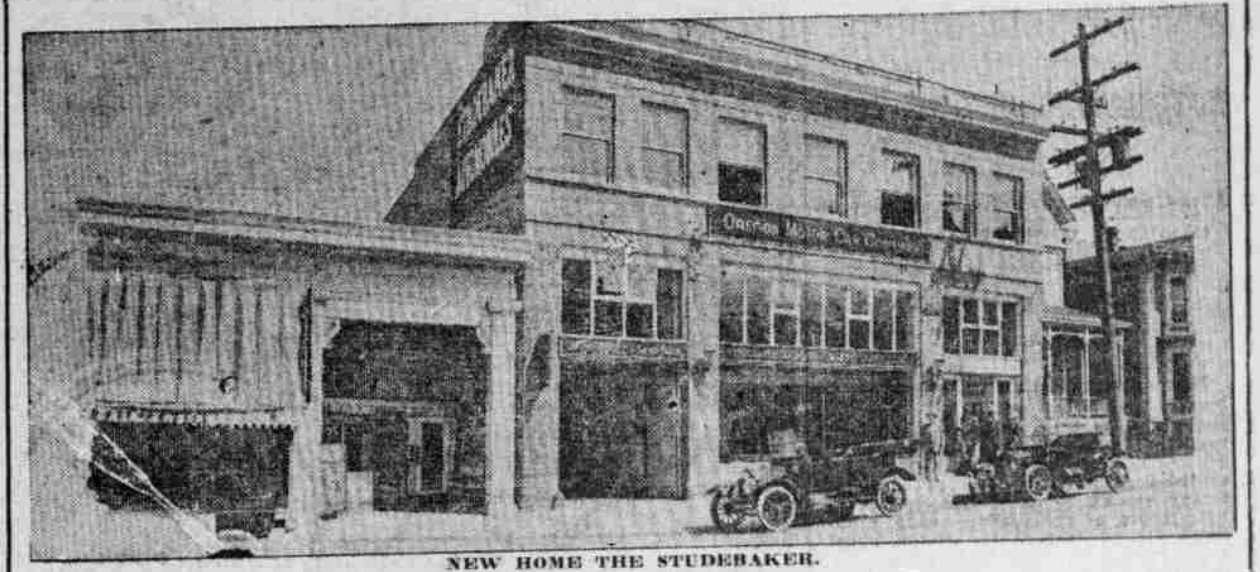
NEW HOME THE STUDEBAKER.