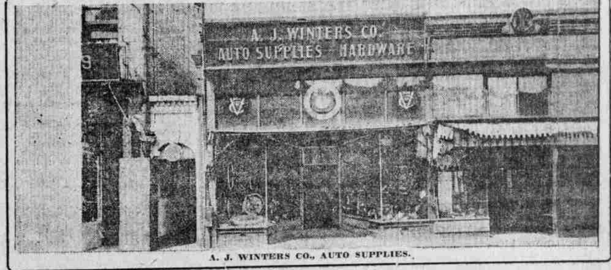
A. J. WINTERS CO. AUTO SUPPLIES.