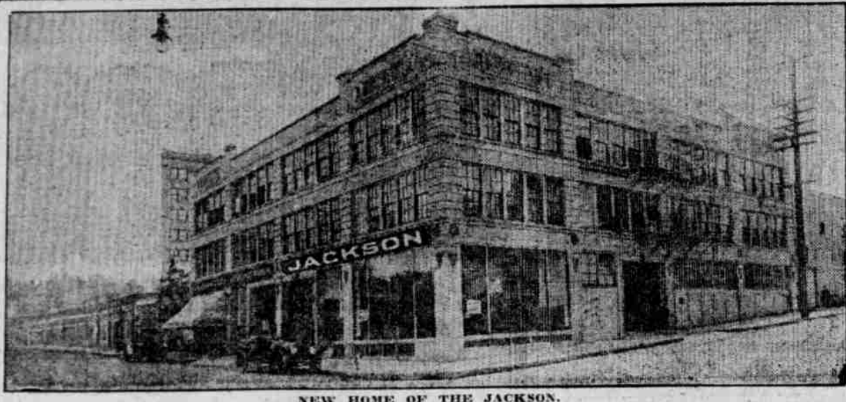
NEW HOME OF THE JACKSON.

Sales Offices, 690 Washington Street. Service Dept., 86th Tenth St.