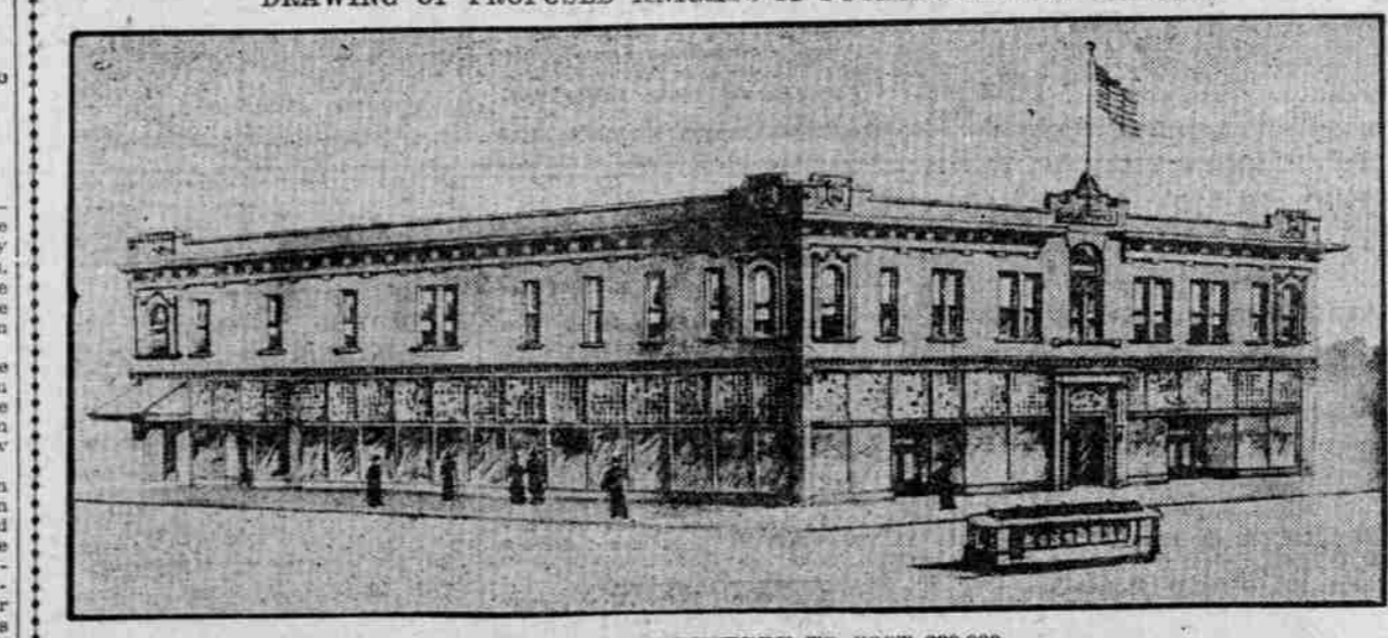
TWO-STORY STRUCTURE TO COST $30,000.

the yield for the United States was, for the same year 2,521,485,000 bushels. The value of the corn crop of the United States is large. The yield for 1911 had a farm value of $1,565,258,000. This wealth grew out of the soil in four months of rain and sunshine, and some drought, too. This was sufficient for the Nation, which was $98,775,770, to pay $375,000,000 for the Panama Canal, and leave a balance of more than $225,000,000 for other purposes.