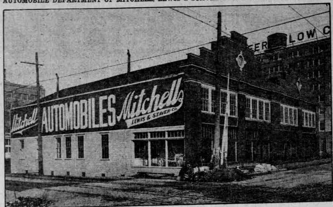
NEW HOME OF MITCHELL "SIX," AT EAST MORRISON AND EAST FIRST STREETS. Steady growth of business during the season just closed and bright prospects for a continuation of this increase, made necessary additional space for the automobile department of Mitchell, Lewis & Staver, the distributors for the Mitchell. The entire building on the northeast corner of East Morrison and East First streets was leased for this purpose, giving plenty of space for showing the models of this popular line. The 1913 designs of the Mitchell are expected here in a few days.

AUTOMOBILE DEPARTMENT OF MITCHELL, LEWIS & STAVER IS MOVED TO NEW QUARTERS