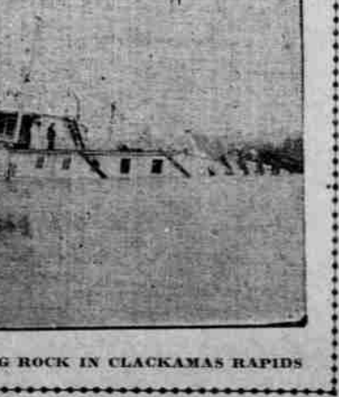
RUTH BEACHED AFTER STRIKING ROCK IN CLACKAMAS RAPIDS