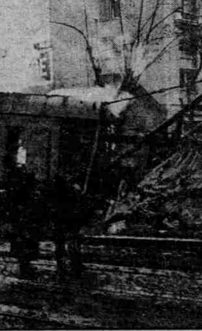
STEAM SHOVEL OPERATING FROM STARK-STREET SIDE.