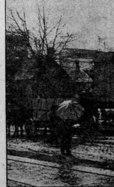
STEAM SHOVEL OPERATING FROM STARK-STREET SIDE.