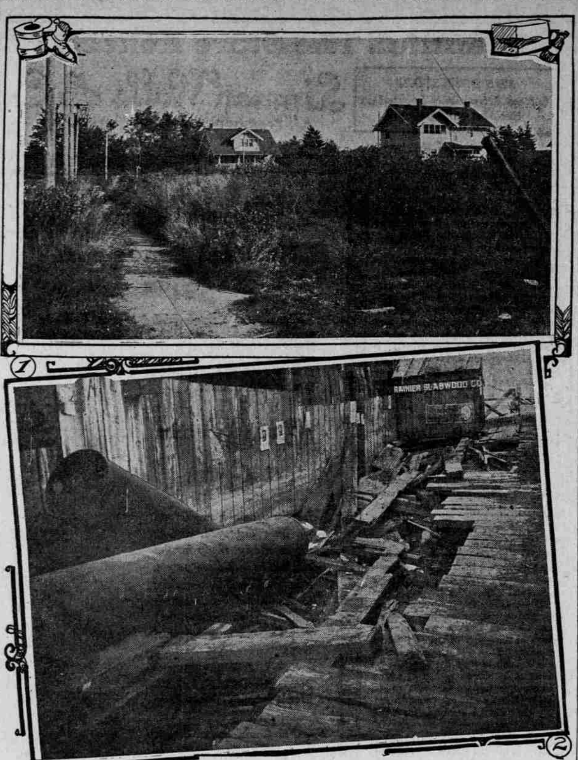
1. SIDEWALKS OVERGROWN BY WEEDS AND GRASS—2. OLD LUMBER AND PIPES ALONG WATERFRONT.