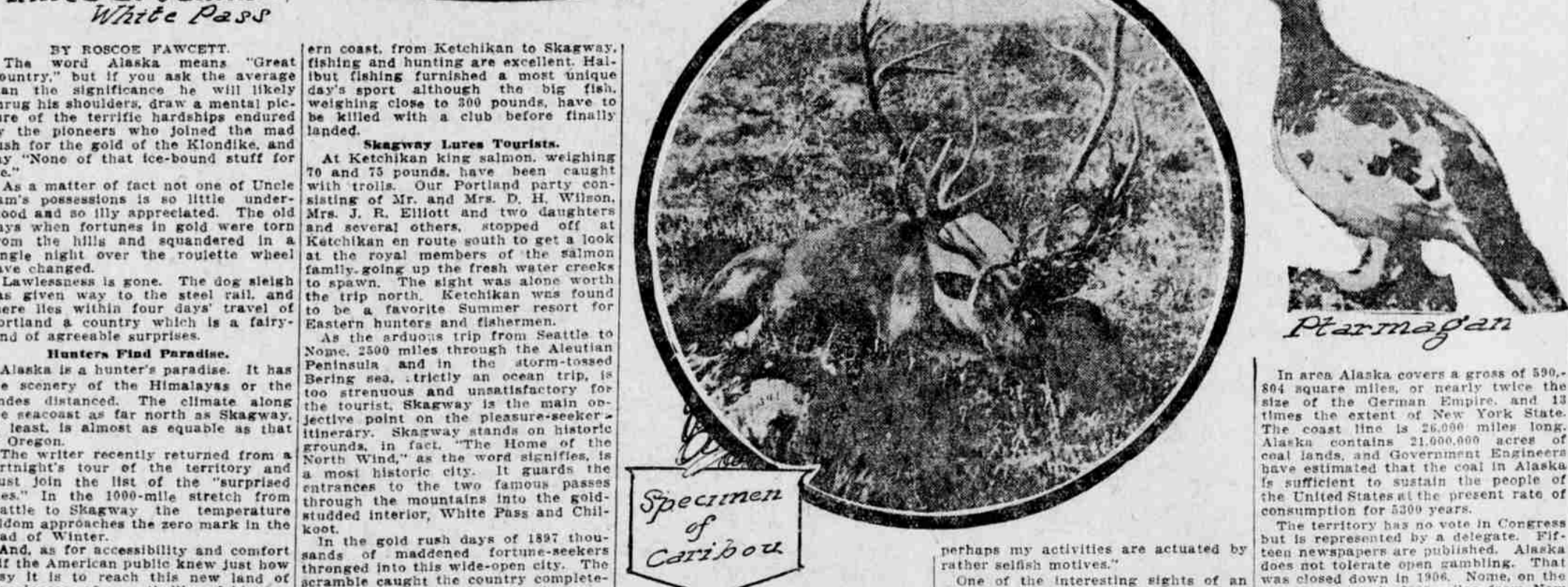
Specimen of Caribou