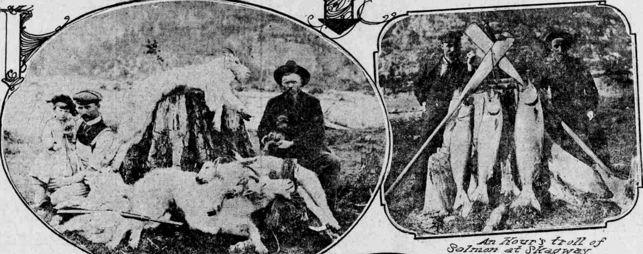
Mountain Goats Killed at Summit White Pass