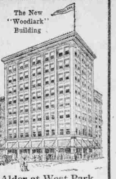
The New "Woodlark" Building Alder at West Park

AMERICA'S LARGEST DRUGSTORE—CANADIAN MONEY TAKEN AT PAR—OPEN A MONTHLY ACCOUNT TODAY—FREE DELIVERY IN THE CITY OF PORTLAND