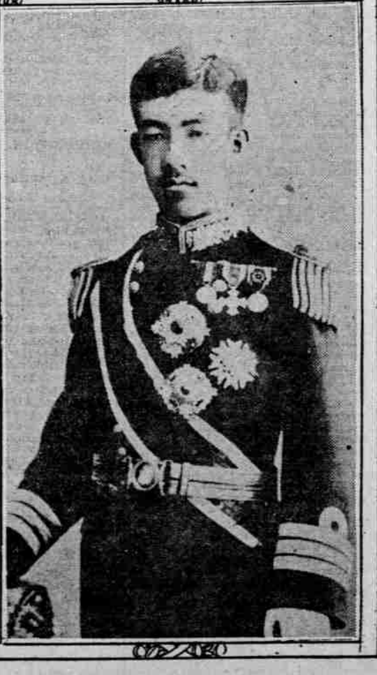
CROWN PRINCE YOSHIHITO