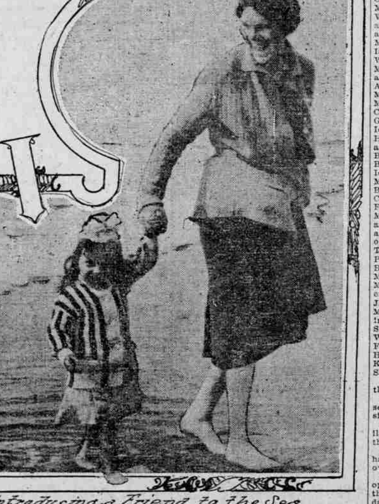
Introducing a friend to the sea.