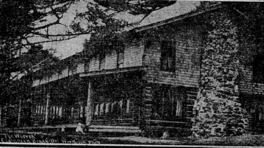
The Warron, Elk Creek Beach, Or.