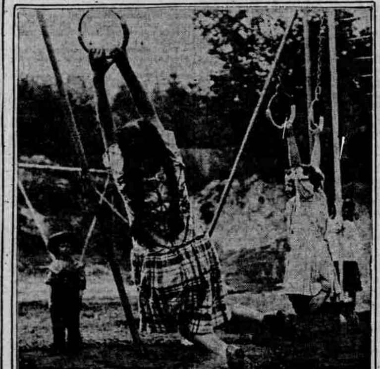
Swinging Hand Over Hand on Traveling Rings, City Park.

Portland still backward. "Portland is far behind other cities in this respect," declared the Superintendent. "Seattle has 22 playgrounds and four community houses, while Portland, an equally progressive city in other respects, has only eight and no community houses at all."