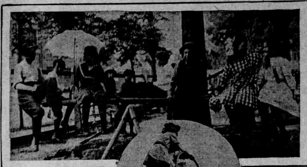
On A Teeter Board, North Portland Park.

Free Lectures, Baths, Musicals, Debates and Gymnasium Add to Facilities Offered in Peninsula Playground; Park Season Opens and Children and Adults Frolic in Natural Recreation Resorts.