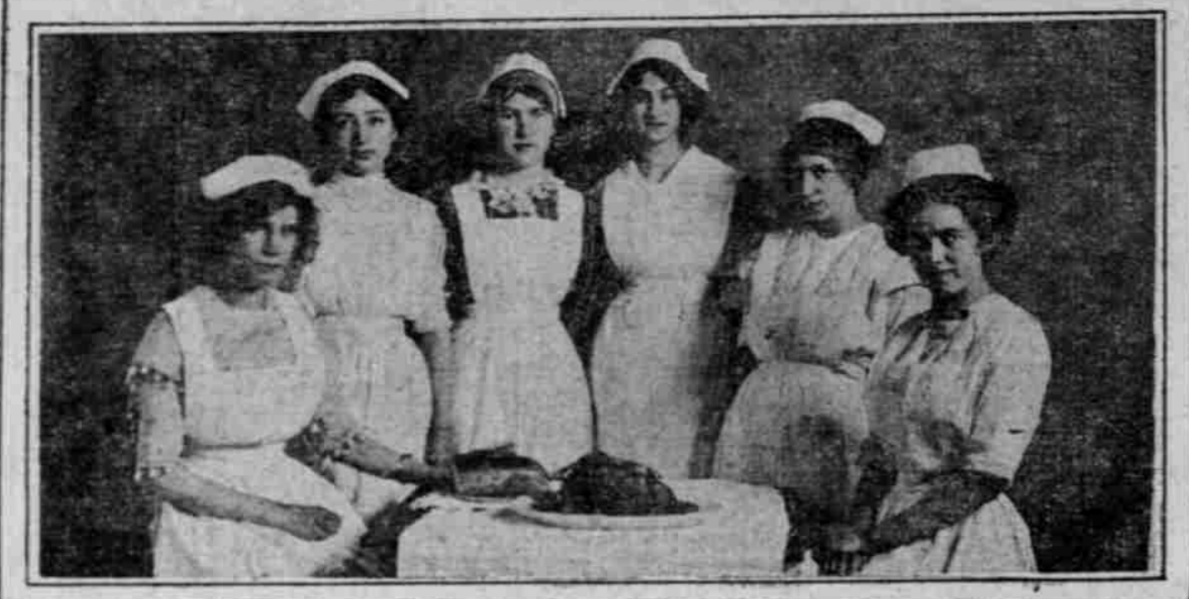
Class of Lincoln Girls

Domestic Science Classes of Washington and Lincoln, in Well-Appointed Exhibits, Show Parents and Friends Results of Practical Training.