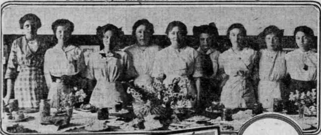
Washington Domestic Science Class