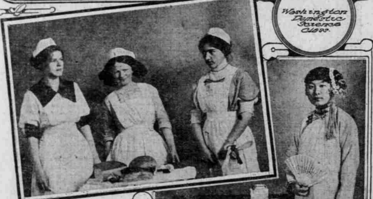
Winners in the Bread Contest, Lincoln High School.

GOVERNORS of sweet things were wonderfully cheered when they visited the exhibition of the domestic science classes at Washington High School Thursday, which followed a similar exhibition at the Lincoln High the preceding day. From one table of exhibits visitors were informed that there was just the same amount of heat-giving qualities in one chocolate cream as in one egg, one piece of meat or a slice of bread. Incidentally they learned that to obtain the same number of calories those whose taste did not run to candy would have to consume the whole of a large plate of pickles, which, quite naturally, was accepted by those who advocated a sugar diet as proof irrefutable of their doctrine. "Joker" Makes Appearance. However, there was a joker in the exhibition. While there were just the same number of calories in the egg, the chocolate cream, the plate of pickles and the hundred and one other comestibles there to be admired and not touched, the anti-chocolate forces were sustained by the information that the exhibition did not attempt to speak of the indigestibility of the various food foods. And, as Miss H. Hipkoe, one of the instructors, remarked: "You would never think of eating half a dozen eggs between meals, so why eat half a dozen chocolates? One chocolate may be fine, but half a dozen—" And then there was depression among the chocolate fiends. The two exhibitions were a cause of strong competition. As soon as the round century of "D. S." students left