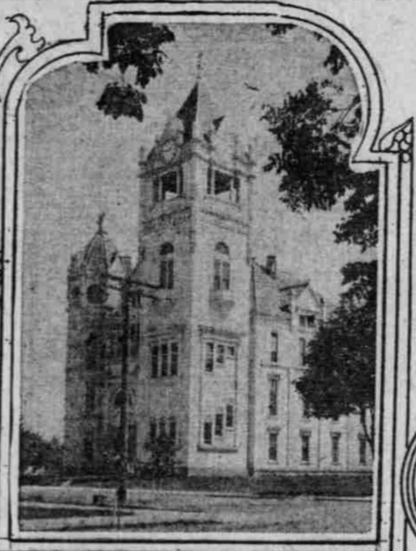
County Court House.