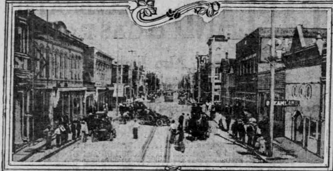
Scene on First Street, Albany, Oregon.

"Hub of Willamette Valley" Takes Pride in Variety of Resources of Its Rich Surrounding Country, Its Substantial Business Buildings and Well Paved Streets.