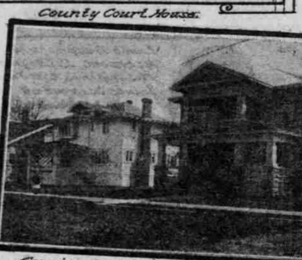
Cusie and Wallace Residences.