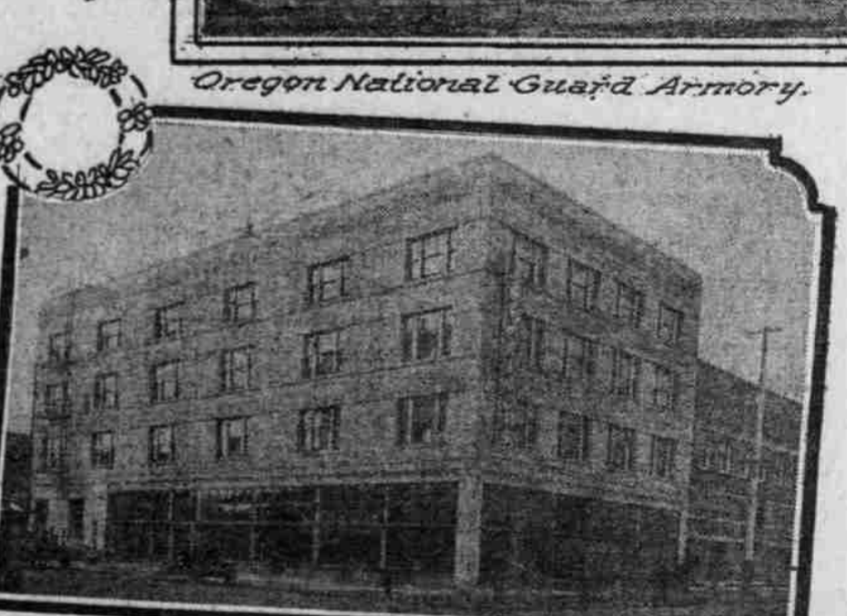
New St. Francis Hotel.

Success For Fulton Won Against Big Odds. Inventor of Steamboat Ridiculed and Discouraged in First Efforts at Navigation.