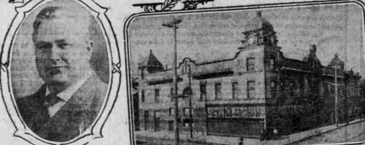
Elks Club and House of Chambers & McCune.