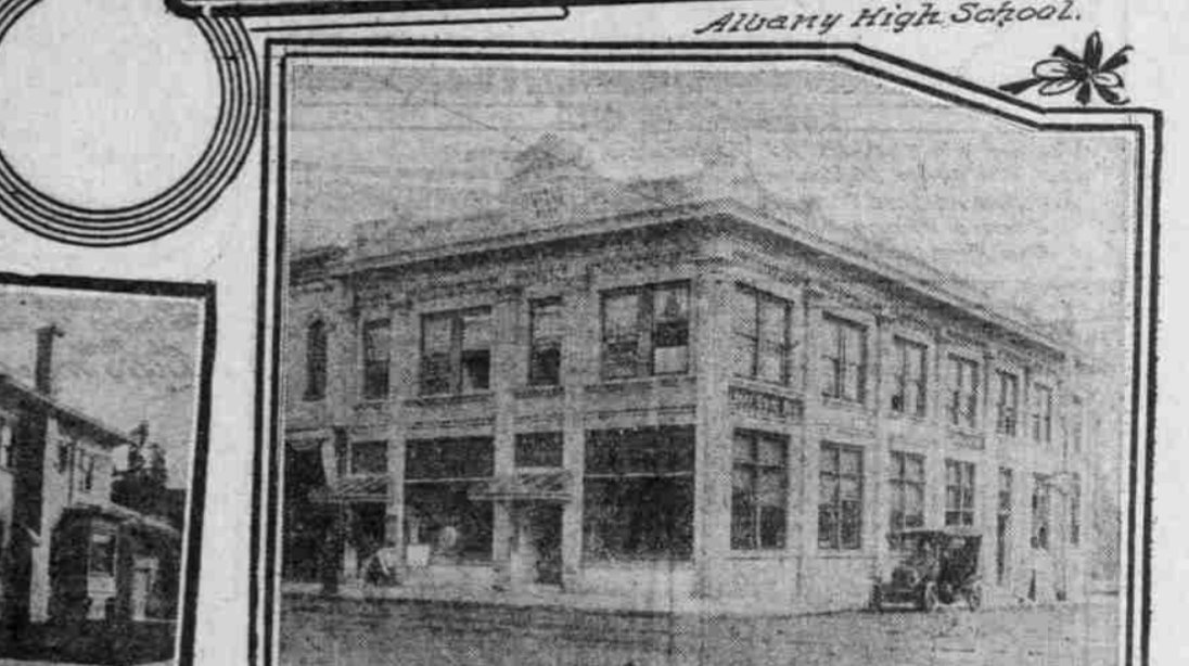
Albany State Bank & Commercial Club.