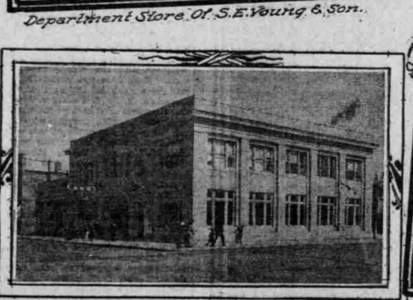
First Savings Bank Building.

Linn County Pulls Together. Linn County has learned the lesson of pulling together and the towns of the county work admirably with the metropolises. Brownsville is on the Calapoosa, 22 miles southeast of Albany, on a branch of the Southern Pacific, with a population of 1800. Lebanon, on the South Santiam, is 14 miles east of Albany, on the Lebanon branch of the Southern Pacific, and has about 1800 people. Seis is eight miles east on Thomas Creek. Harrisburg is on the Willamette River and main line of the railroad, 28 miles south of Albany. Albany and Linn County expect great things the next few years, and if the business activity at Albany is any barometer there will be no disappointment in the way of expectations. Every-thing points to splendid achievement. Albany College is expected to de-