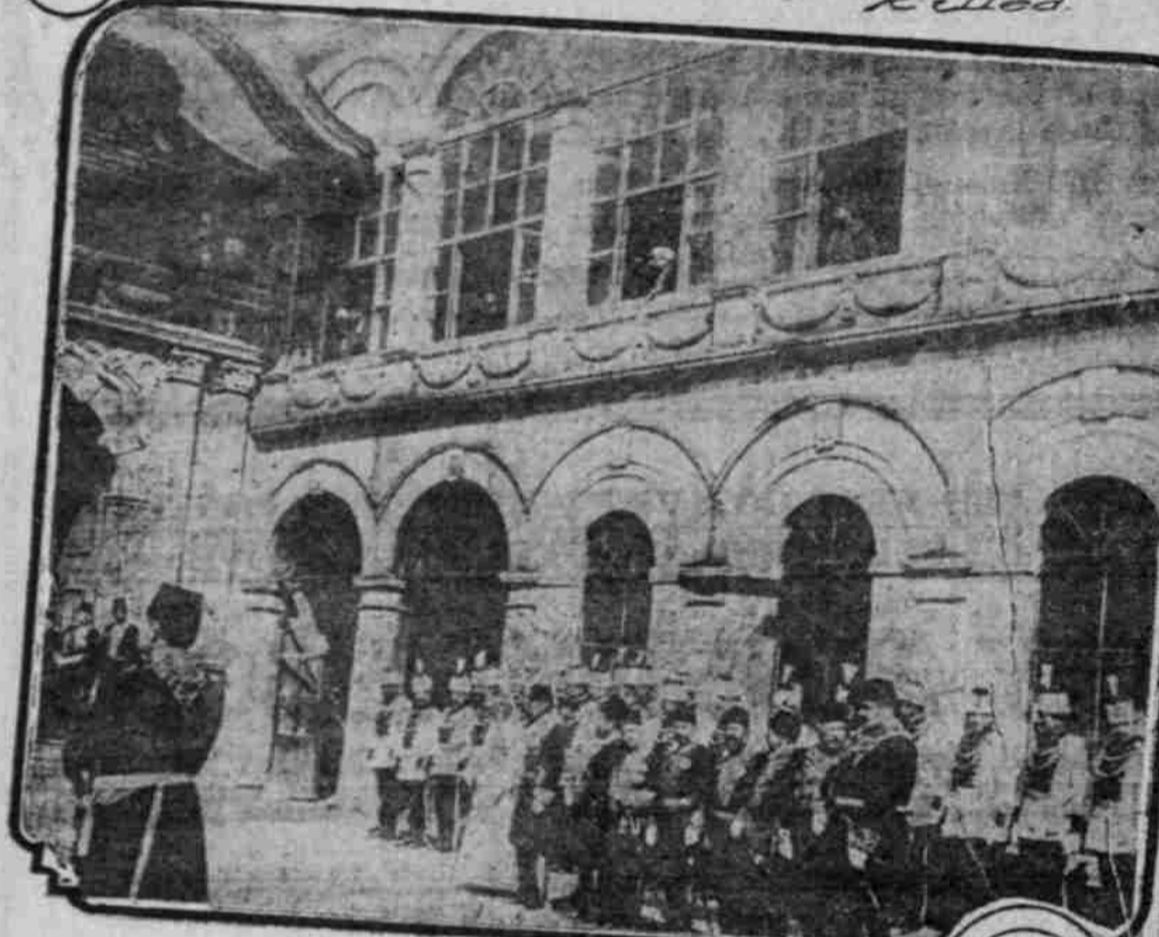
New Turkish Cabinet