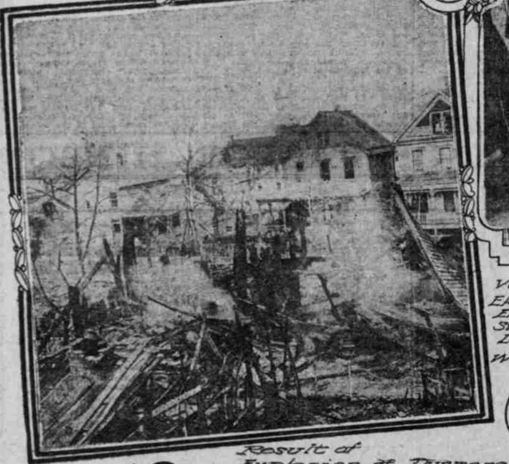
Result of Explosion at Dunmore Pa