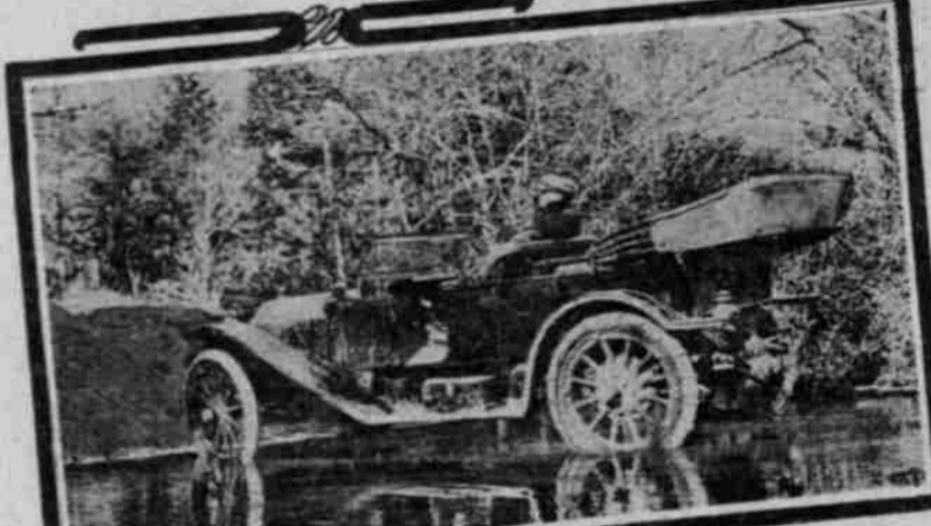
Feeding One of the Numerous Streams Encountered on Trip to Southern Oregon.