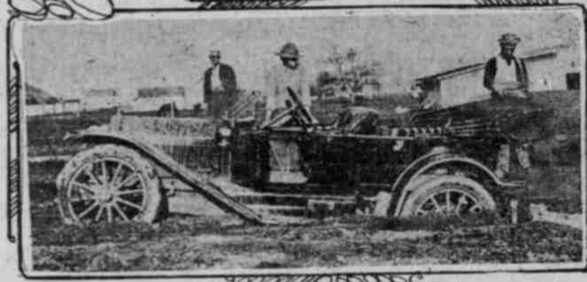
Ideal Roads Near Sutherlin, About 18 Miles North of Roseburg.