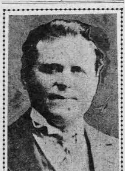
Marry Oregon Live on a Farm. Woman