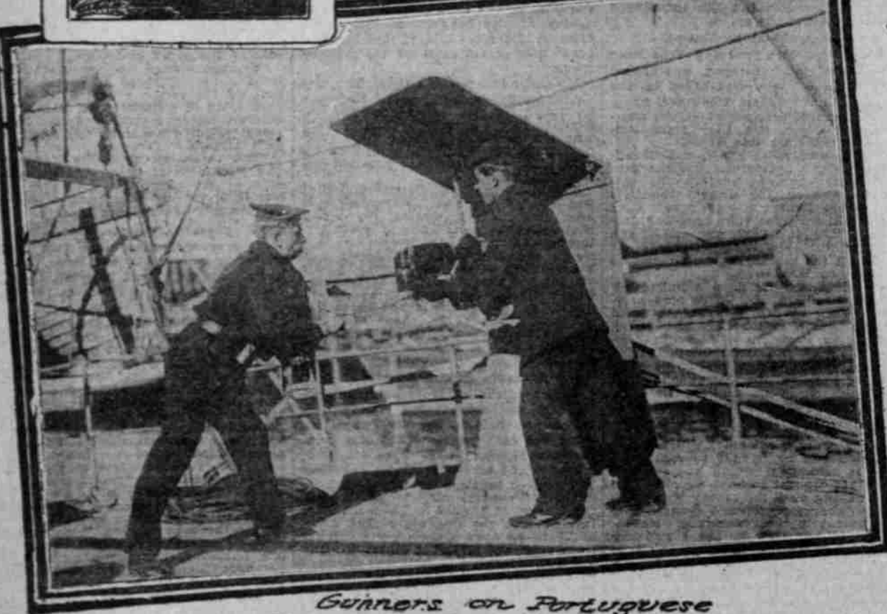
Gunners on Portuguese Gunboat Republica