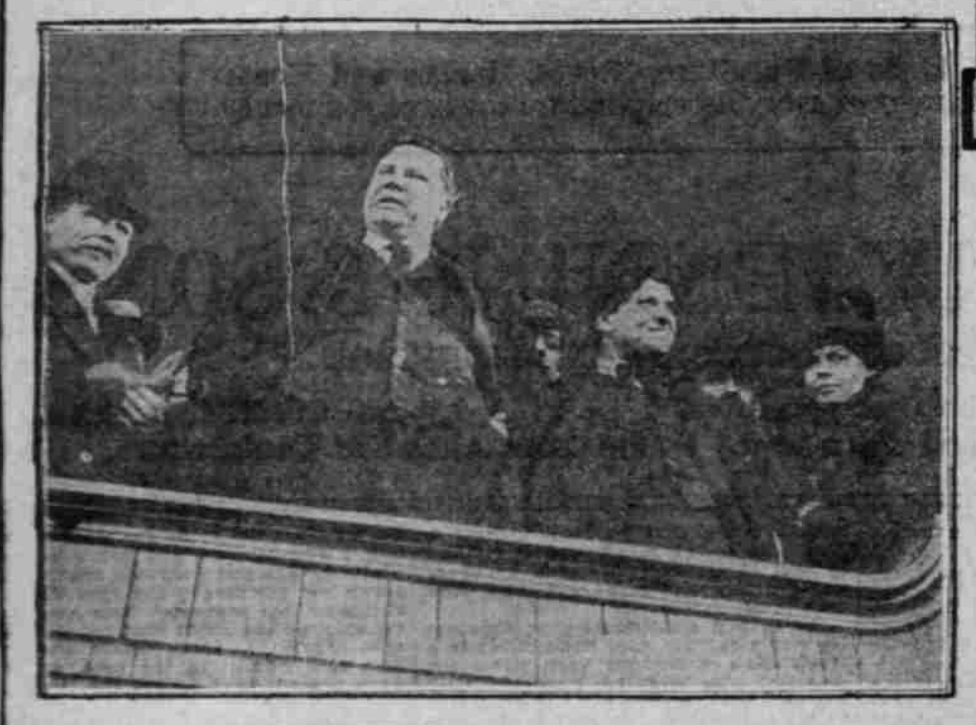
William D. Haywood Addressing Mill Strikers at Lawrence: