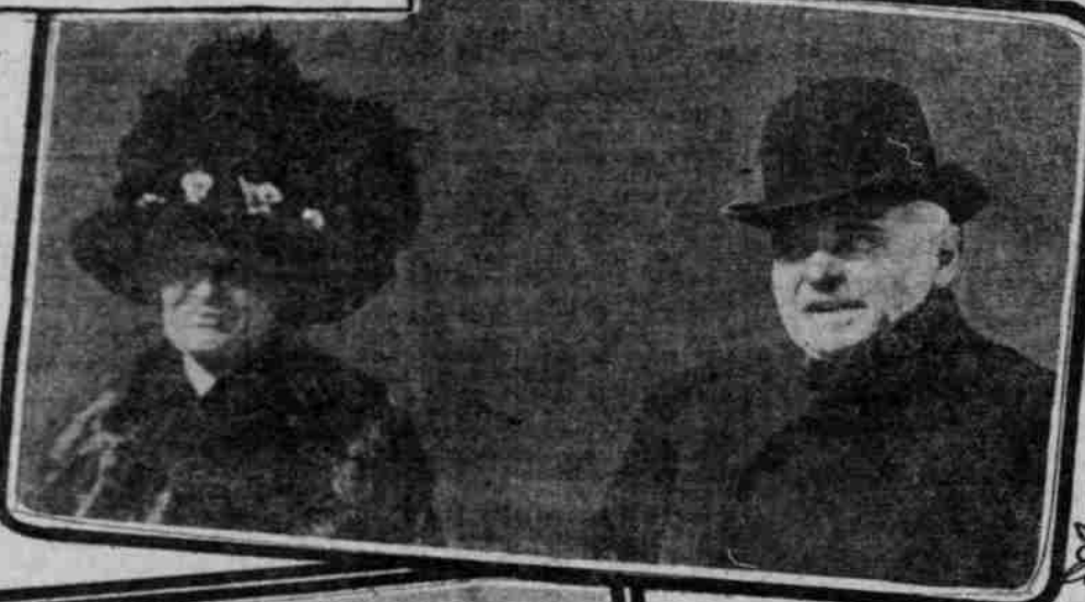
Col. Goethals and Daughter-in-Law Arriving in America