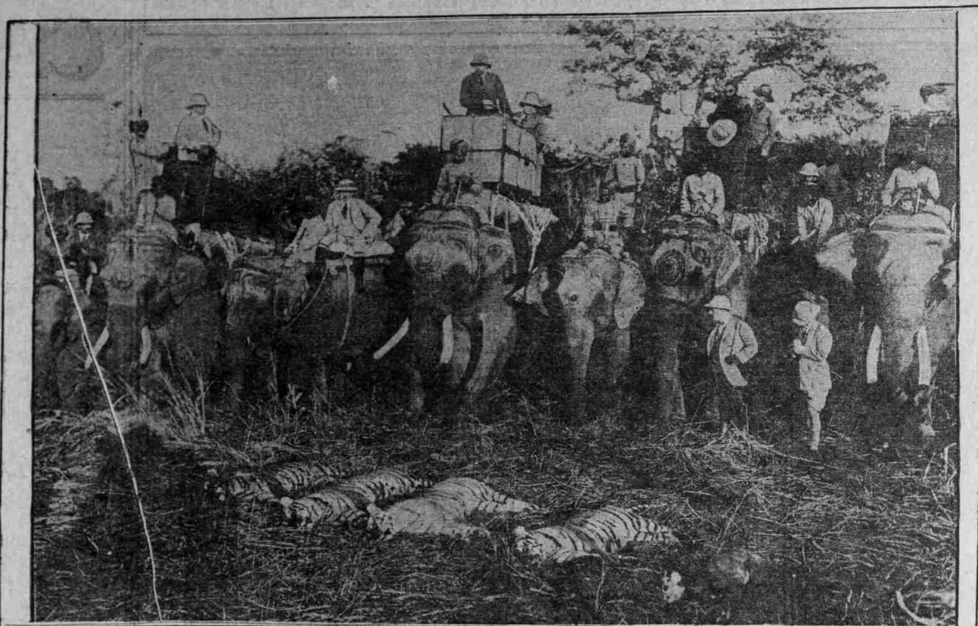
King George Viewing Results of Day's Hunt