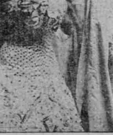
TWO OF THE QUARTET OF FAMOUS "SOCIETY TEXAS TOMMY" DANCERS AT THE EMPRESS. Society women who have described as "awfully fascinating" the far-famed "Texas Tommy" and its accompanying "Frisco Rag" and other equally as novel dances will have an opportunity to catalogue the movements into their proper class at first hand next week.