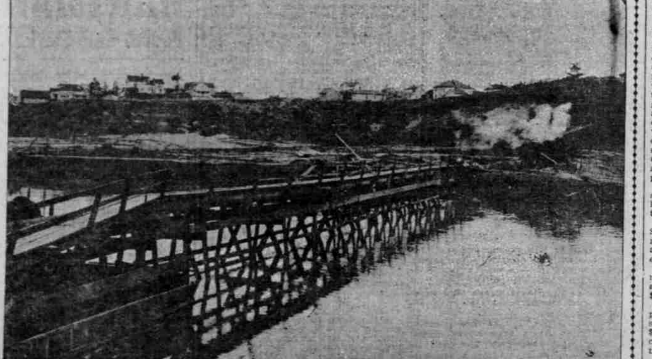
PROPERTY KNOWN AS MONTGOMERY TRACT, LOCATED IN LOWER ALBINA.