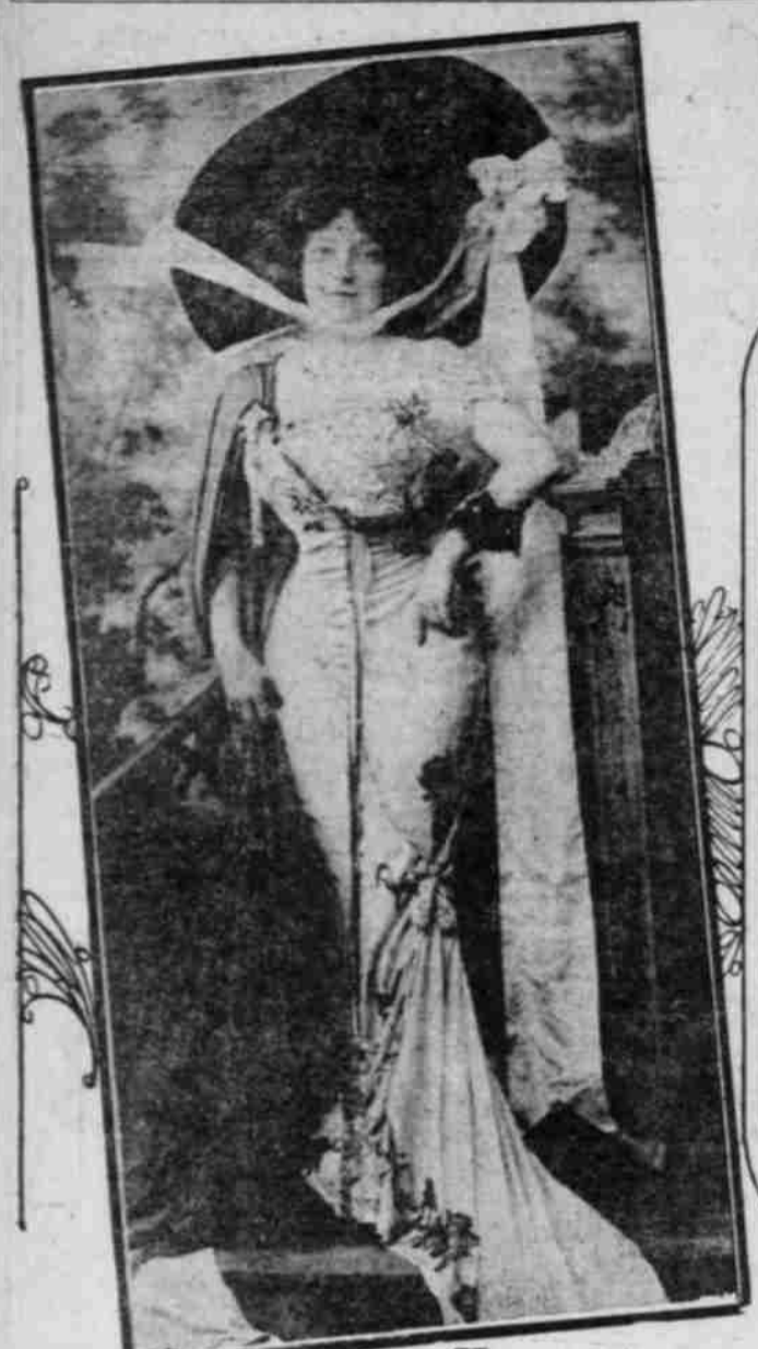
ANNA HELD IN 'MISS INNOCENCE' AT THE HELLIG.