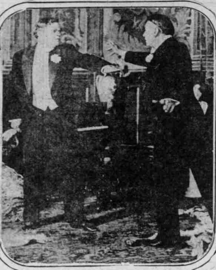
'ALL RIVERS MEET AT SEA' DRAMA AT THE EMPRESS.