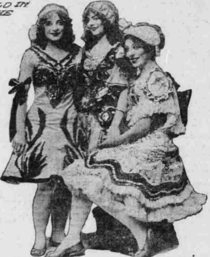
ALPINE TROUPE AT THE ORPHEUM.