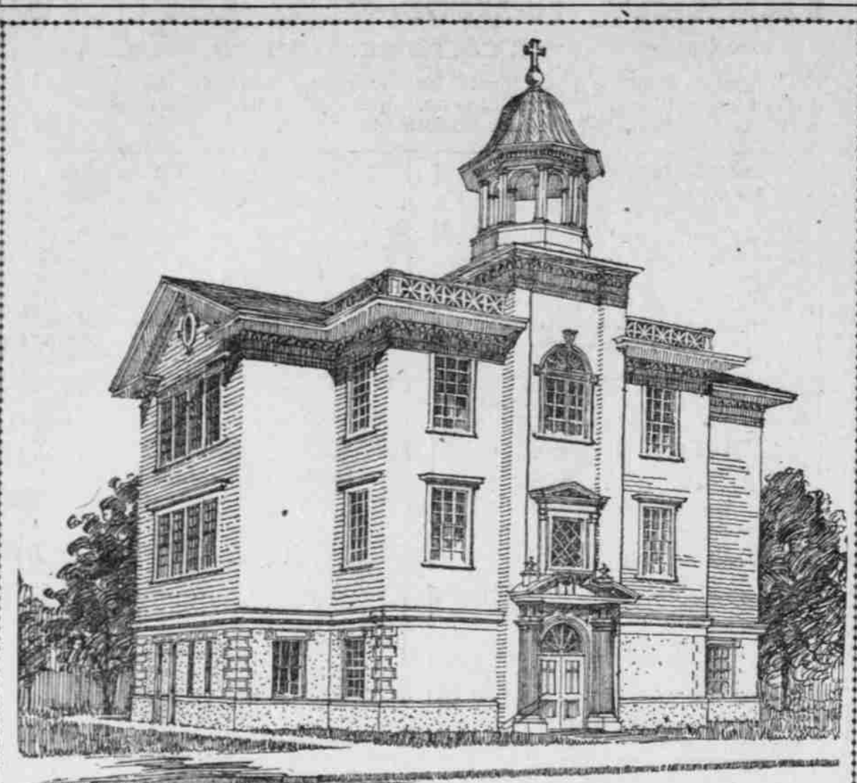
THREE-STORY STRUCTURE AT LENTS NOW READY FOR USE