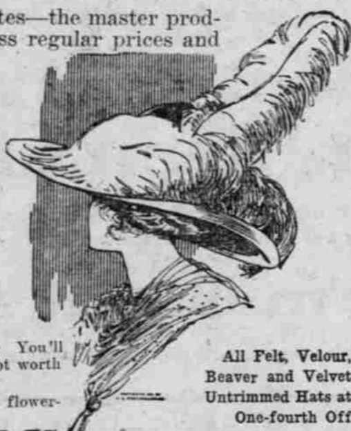
All Felt, Velour, Beaver and Velvet Untrimmed Hats at One-fourth Off