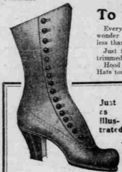
Just as Illustrated

Just from their wrappings—new, fresh and pretty. Tailored and flower-trimmed models. Velvets, rich velours and fine fur felts. Hood and brim styles. Choose modish $12.50 to $20.00 Highland $9.75 Hats tomorrow at the Distribution Sale price while they last—only $9.75