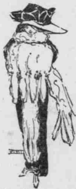
Marabou for Tone

—If you were to walk up Fifth Avenue and note the window displays and exhibitions of that city's exclusive shops you would be struck at once with the elaborate displays of marabou neckwear.