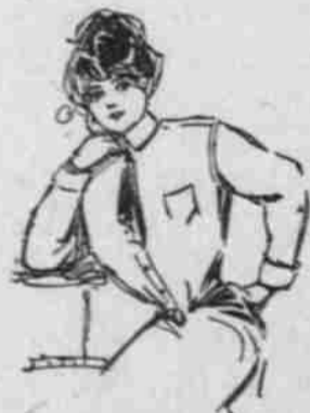
Mannish Shirts at $2.50

—These shirts are made of striped Botana cloth, Anderson's Scotch flannel and fancy corded shirtings.