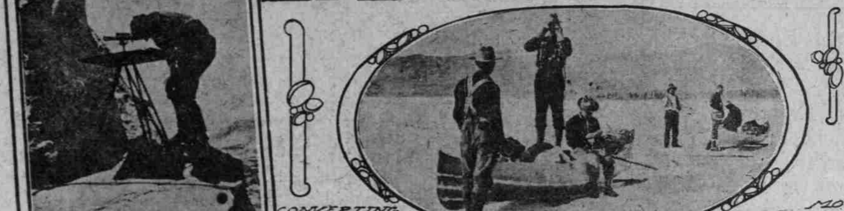
CONVERTING BOATS INTO SLEEPS ON AN ALASKAN LAKE