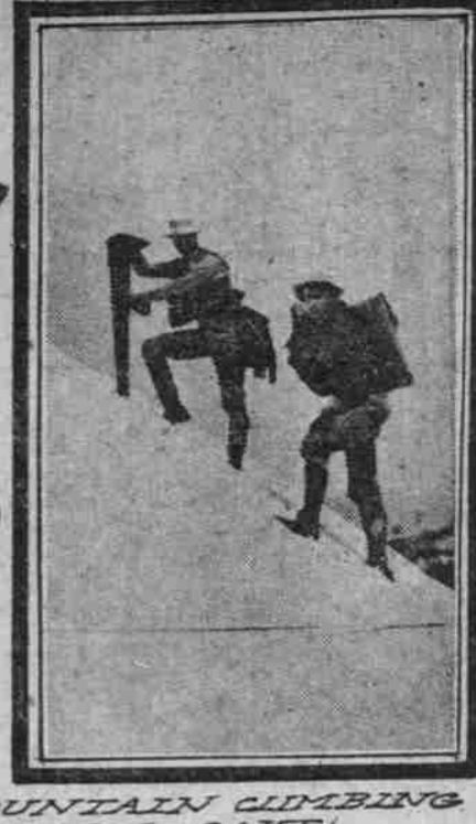
MOUNTAIN CLIMBING FOR SCIENCE SAKE

at breakneck speed, and leaving one of them stranded in a rock, and the pulling off of two of the men by a "sweeper" or overhanging tree. In this latter emergency one man swam ashore and the other was following a narrow neck by the man still on the raft and pulled aboard.