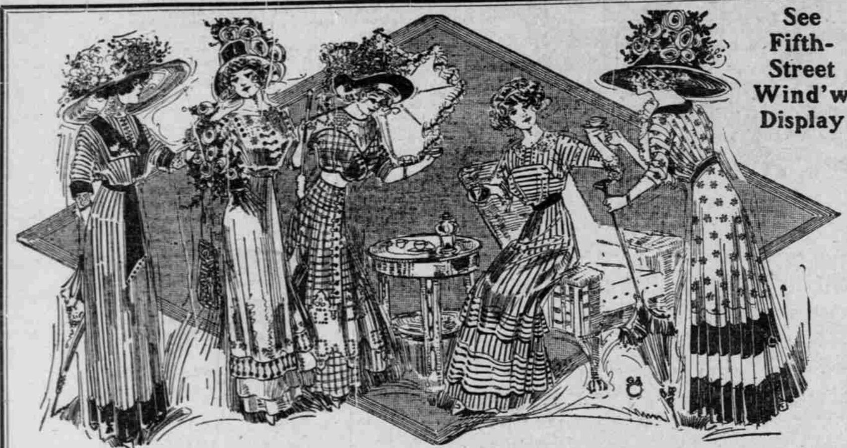
See Fifth-Street Wind'w Display