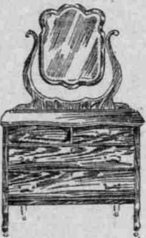
THIS IS SOLID OAK DRESSER $11.50 Has 17 in. by 27 in. base, with two full width and two smaller top drawers, bevel mirror measures 15 in. by 25 in. Golden finish.