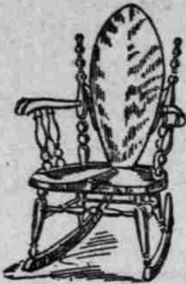
This $9.25 Arm Rocker for... $4.45 —Shows quarter-sawed stock oak, in golden finish. Patterns similar to this one, with cobler seat, at same price.

Proportionate Reductions Shown Throughout the Furniture Stock