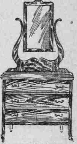
This $12 Solid Oak Dresser $8.90 Has 17 in. by 23 in. base, with three full-width drawers. Mirror measures 11 in. by 19 in. Golden finish.