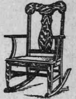
This $8.50 Arm Roker for... $3.90 A comfortable and attractive pattern in quarter-sawed golden oak, with leather seat.