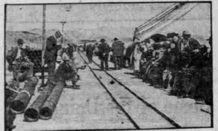
BOARD WALK AND RAILROAD AT BAYOCEAN.

Improvements Rushed to Accommodate Tourists This Season—Hotel Annex Complete and Tent City Is Made Most Inviting.