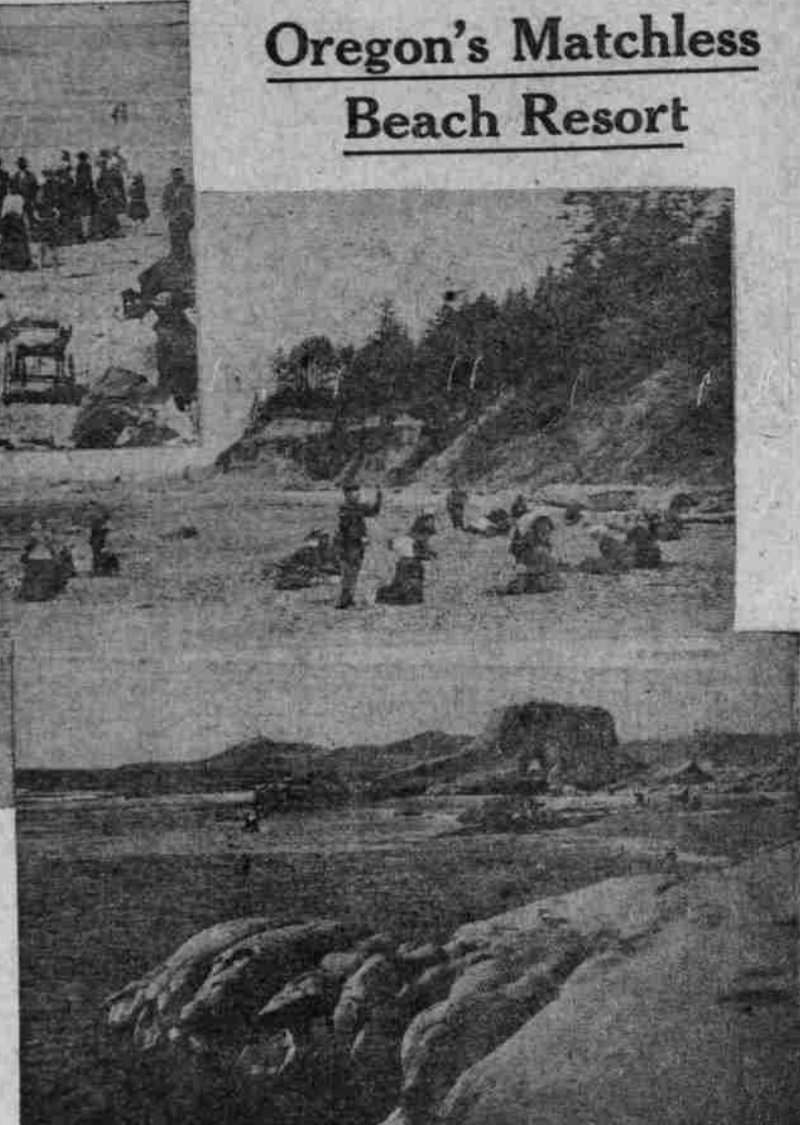
Near Newport, Jump-Off Joe and Yaquina Head in the background.

ITS FACILITIES ARE COMPLETE—Best of food and an abundance of it. Fresh water from springs. All modern necessities, such as telegraph, telephone, markets freshly provided every day. Fuel in abundance. Cottages partly furnished or unfurnished to be had cheaply. Strict municipal sanitary regulations.