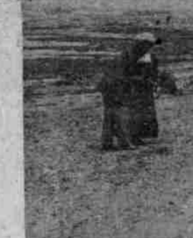
Hunting for Agates, near the Devil's Punch Bowl.

The place to go for perfect rest and every conceivable form of healthful and delightful recreation