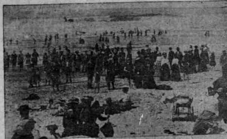
Bathing on Nye Beach.