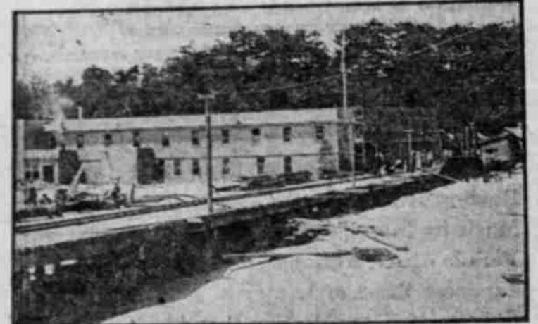
CONSTRUCTION SCENE AT BAYOCEAN.