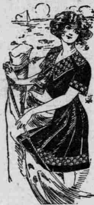
Bathing Shoes, Caps

Five Dollars —Women's bathing suits of extra quality navy mohair, made in a new Princess model, with plaited waist and skirt. The square yoke is braided with white soutache.