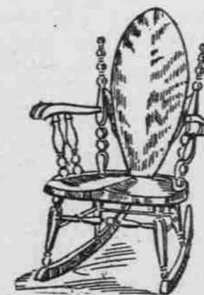
This $8.25 Arm Rocker in Golden Oak now $5.75 —Shows quarter-sawed stock, with cobler or saddle pattern seat.

in the Golden Oak, Mahogany and Mahogany Finish. Noteworthy Reductions on Every One of Them