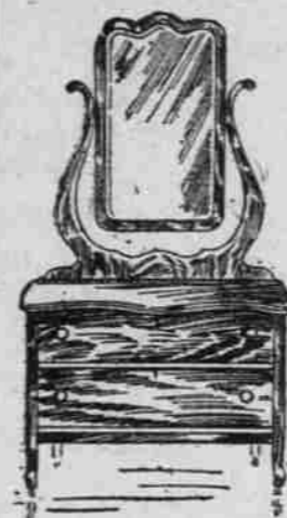
This $16.50 Princess Dresser for $9.75 —Of solid oak, in golden finish; has bevel plate mirror which measures 17½ in. by 22 in.; one of the newest patterns on our floor.

40 Yards to the Roll—Most Desirable Patterns Matting, worth $12 roll—now ..... $6.00 Matting, worth $14 roll—now ..... $7.00 Matting, worth $16 roll—now ..... $8.00 Matting, worth $18 roll—now ..... $9.00 Matting, worth $20 roll—now ..... $10.00 Matting, worth $22 roll—now ..... $11.00 Matting, worth $24 roll—now ..... $12.00 Matting, worth $28 roll—now ..... $14.00 Matting, worth $30 roll—now ..... $15.00