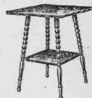
This $3.00 Solid Oak Center Table now $1.75 —In golden finish; has fancy edged top and turned legs; a well-made and well-finished table and a splendid bargain.

$3.75 Solid Oak Center Table for ..... $2.20 $3.85 Round Center-Table, in mahogany finish, now ..... $2.00 $4.00 Center-Table, in mahogany finish, at $2.00 $6.00 Center-Table, in mahogany finish, at $3.45 $6.50 Center-Table in quarter-sawed golden oak, now ..... $3.95 $7.00 Center-Table, in quarter-sawed golden oak, now ..... $4.75 $8.50 Mahogany Center-Table, now ..... $5.00 $10.50 Center-Table in quarter-sawed golden oak, now ..... $6.70 $12.50 Center-Table, in quarter-sawed golden oak, now ..... $7.90 $25.00 Fine Mahogany Center-Table, now $14.95 $28.00 Heavy Center-Table, in quarter-sawed golden oak, now ..... $14.00