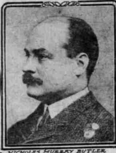
NICHOLAS MURRAY BUTLER