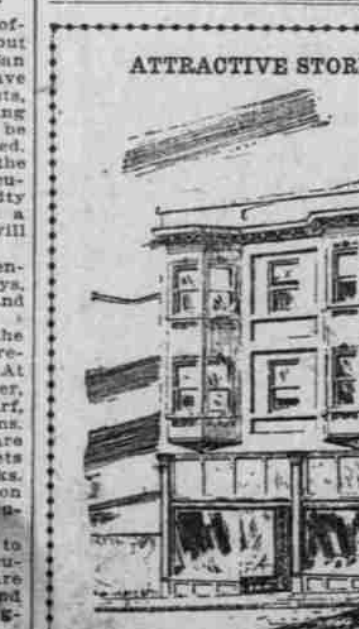
ANDREW GORDON BUILDING, WHICH WILL BE ERRECTED AT WASHINGTON, MORRISON AND ELLA STREETS.

Andrew Gordon Building, which will be erected at Washington, Morrison and Ella streets.