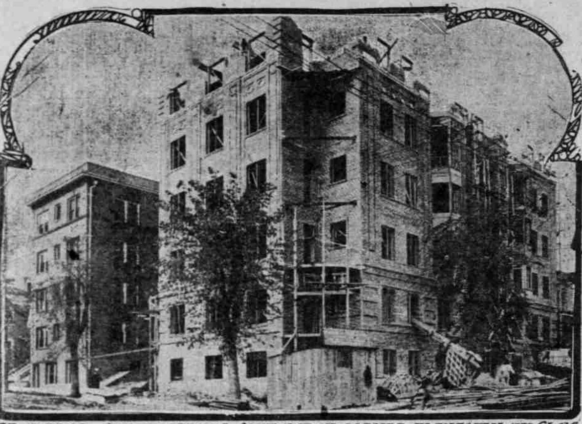
CLAYPOOL APARTMENTS, SOUTHWEST CORNER ELEVENTH AND CLAY.

Chetopa Annex, at Eighteenth and Flanders, Is Finished—Claypool, at Eleventh and Clay, and Fairmont, on Eleventh, Near Jefferson, Are Now Under Way.