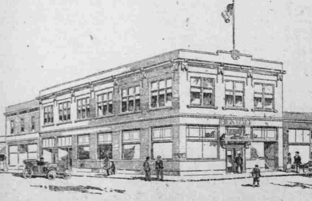
BUILDING BEING ERRECTED BY AMERICAN NATIONAL BANK AT HILLSBORO.

Walls are about half way completed for the new two-story building of the American National Bank at Hillsboro. The structure was designed by DeWitt and Webber, architects, of Portland.