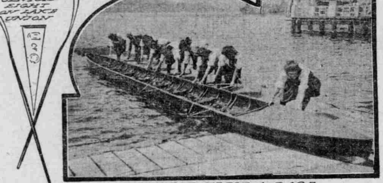
RETURN FROM A RACE.

UNIVERSITY OF WASHINGTON, Seattle, April 22.—In developing the best athletics for the women of the University of Washington, the co-eds have been particularly blessed with the natural advantages which few colleges of the country are afforded. With two lakes nearby and with all the best of equipment, the University of Washington women have taken hold of aquatic sports with enthusiasm equalling that of the men who race on the same lake.