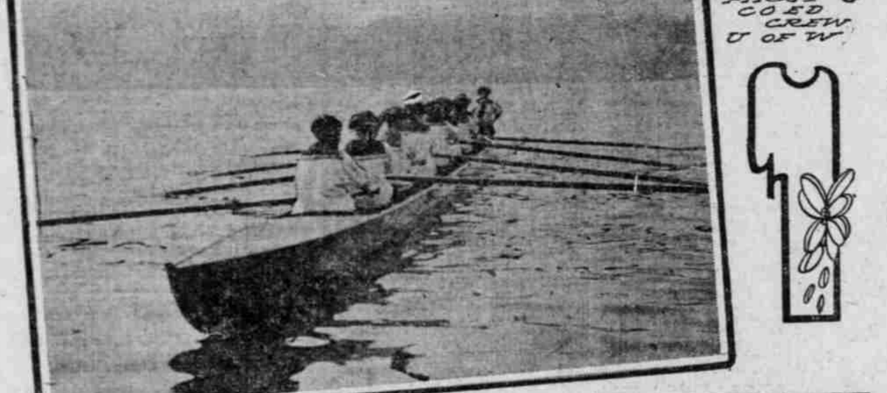
SENIOR EIGHT ON LAKE UNION