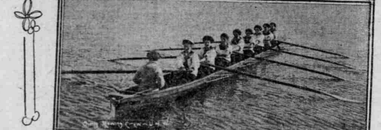
FIRST CO-ED CREW OF W.