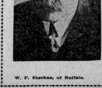
W. F. Sheehan, of Buffalo.

RIVAL DEMOCRATIC CANDIDATES FOR SENATOR FROM NEW YORK.