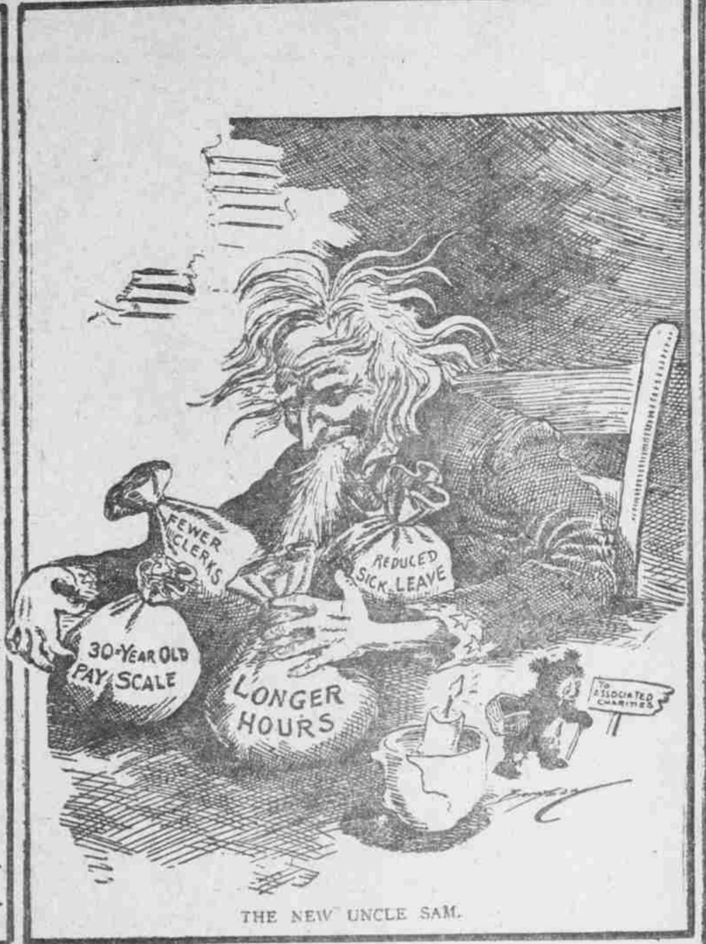
THE NEW UNCLE SAM.