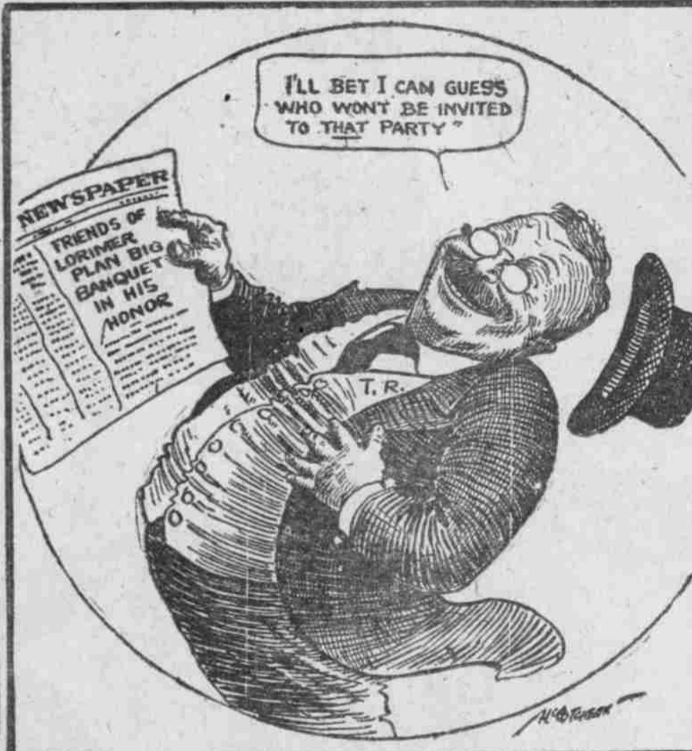
I'LL BET I CAN GUESS WHO WON'T BE INVITED TO THAT PARTY?