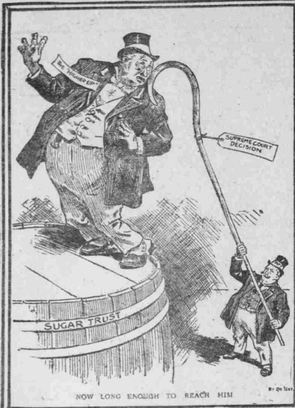
NOW LONG ENOUGH TO REACH HIM