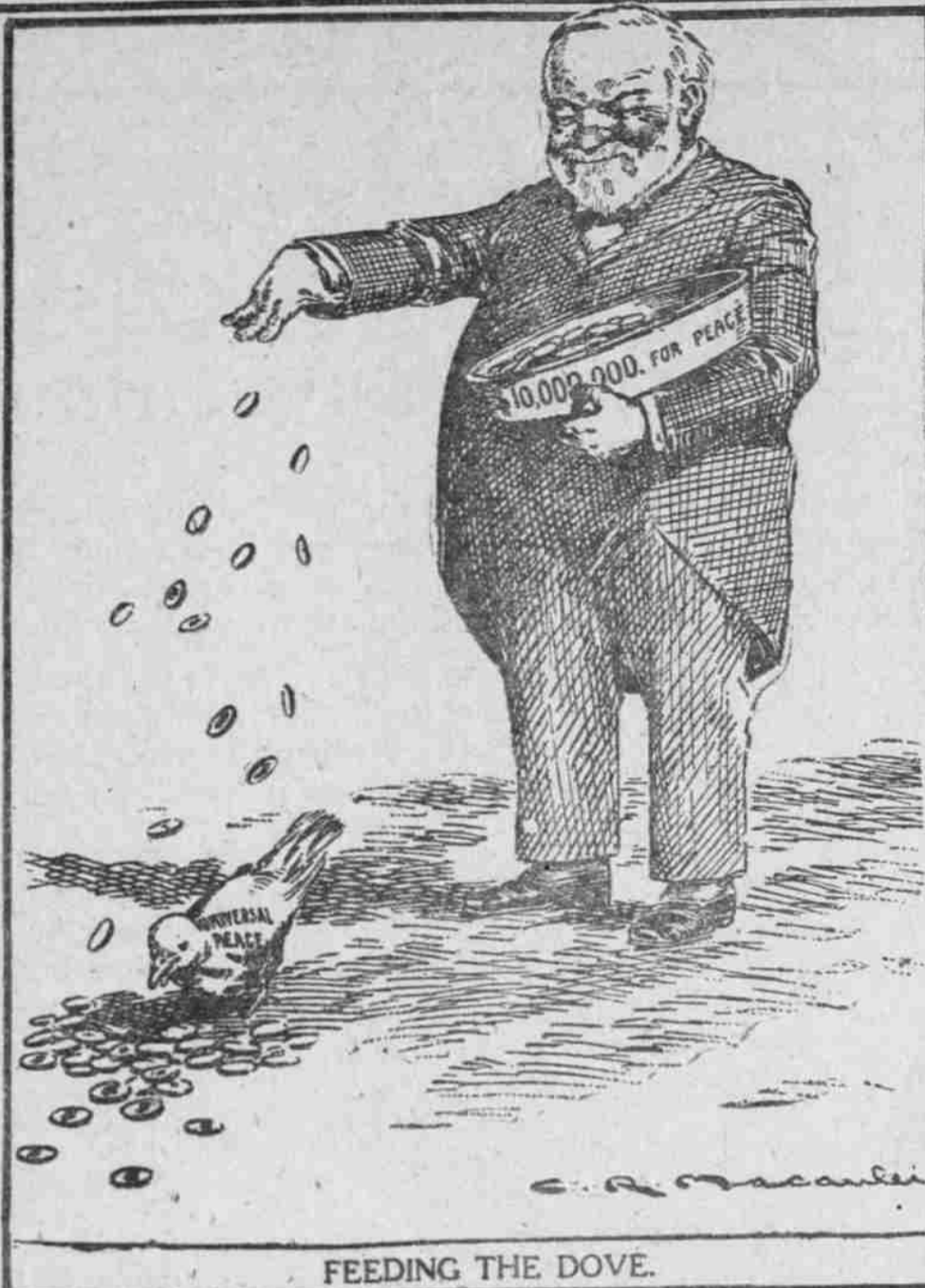
FEEDING THE DOVE.