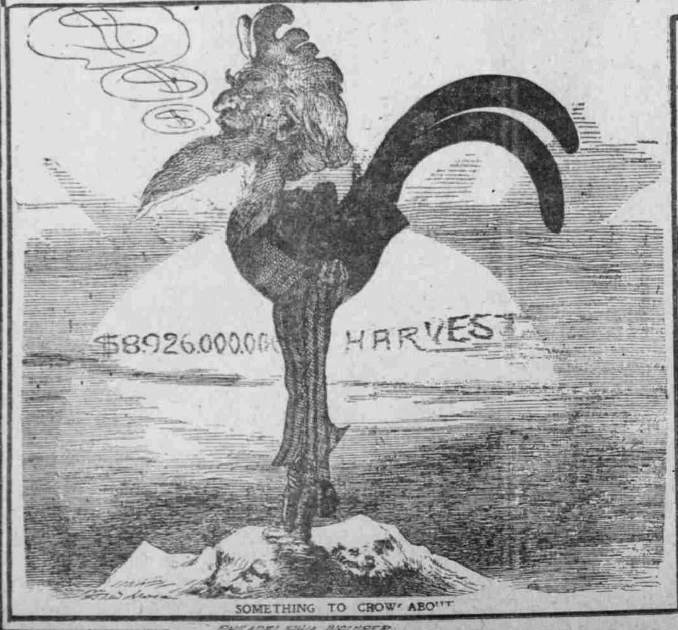
SOMETHING TO GROW ABOUT