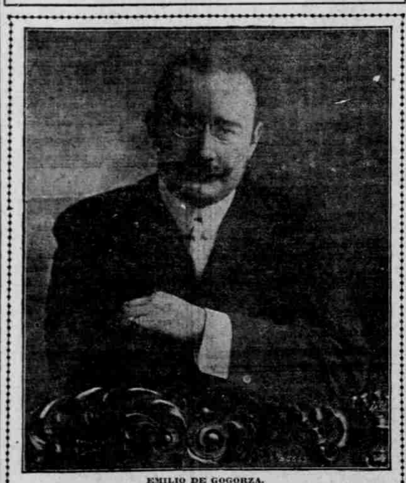
EMILIO DE GOGORZA.

Famous Spanish Singer to Appear at Hellig Theater January 3 in Captivating Programme—San Francisco Music-Lovers Find Vocalist Better Than Ever.