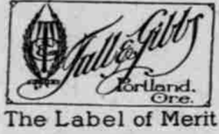
The Label of Merit

We are pleased to announce that our showing of these is now complete, all of them more or less elaborate, and although following fashion's dictates as to narrow-skirts are not the extreme or "hobble" style. So skillfully are they designed that in spite of their straight lines they are truly very graceful. Every delicate tint is shown—ivory, white, cerise, scarlet—the favored shade of Poiret this season, light blue, pale rose pink, violet, tinted snuff brown over pink and many other dainty shades. $75 to $375.