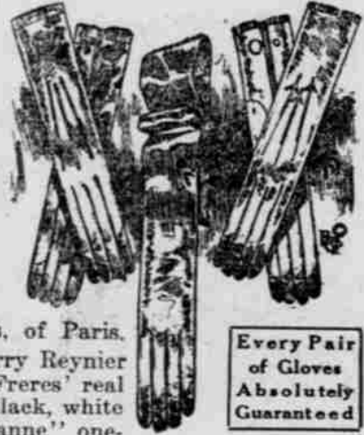
Every Pair of Gloves Absolutely Guaranteed

With its entirely new and complete line of Gloves from the best French, English and domestic makers, an up-to-date department, with every convenience and expert fitters, this new store section is now prepared to meet the most exacting glove needs.