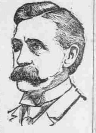
The Leading Specialist.

I Have the Largest Practice Because I Invariably Fulfill My Promises There's no drawing the line between curable and incurable ailments. Each individual case must be considered. Most doctors claim that among the class ailments peculiar to men one or two are incurable. The idea is wrong. I have demonstrated that it is wrong, for I cure all ailments of men. The truth is that some cases of curable ailments are incurable by some doctors, and some cases of so-called incurable ailments are easily curable by the right methods. I by no means claim the ability to cure any every case that may come to my office, but I claim to cure most of the cases that others cannot cure, and I always refuse treatment where conditions indicate that I will be unable to obtain thorough and lasting results.