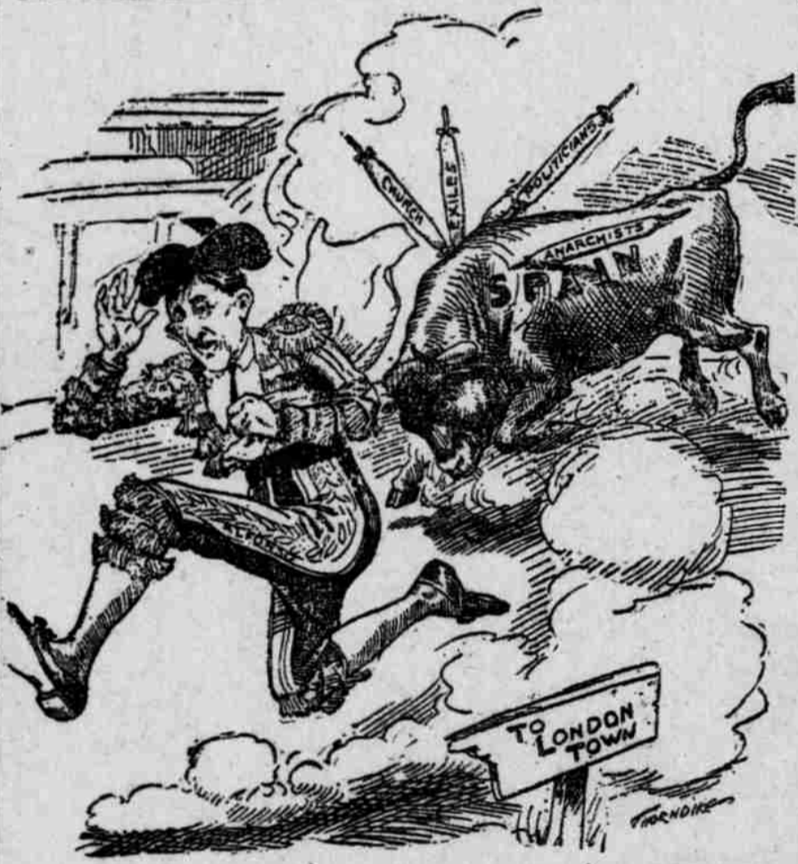
HIS SUBJECTS WANT HIM TO HAVE A BULLY TIME