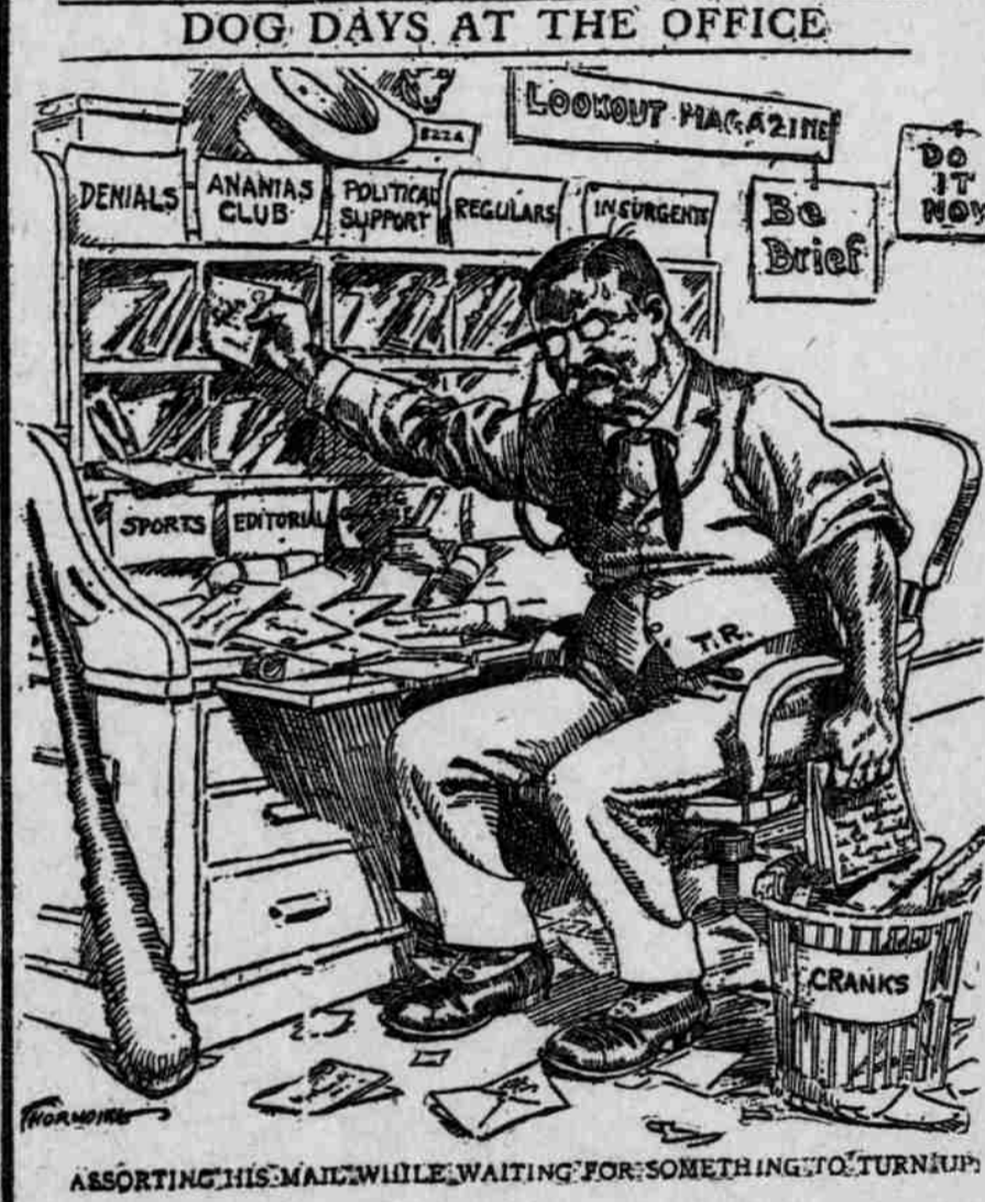
ASSORTING HIS MAIL WHILE WAITING FOR SOMETHING TO TURN UP