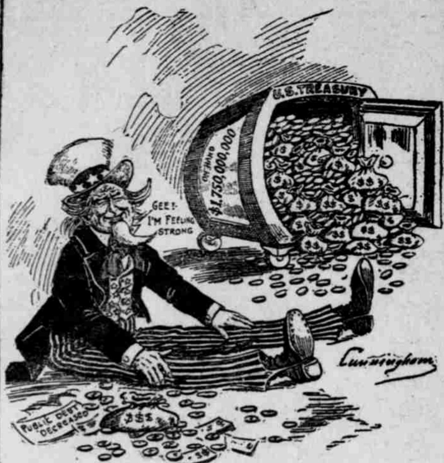
HOT WEATHER PROSPERITY.