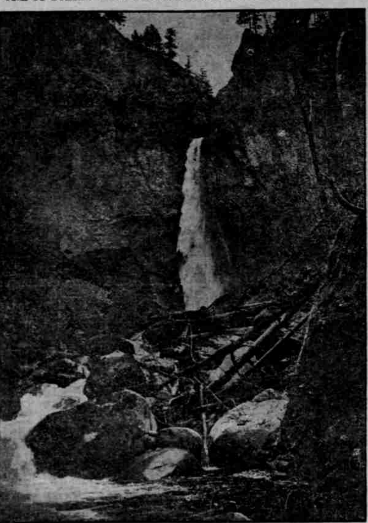
PIERCE FALLS, NEAR WARRENDALE, ON THE COLUMBIA RIVER.