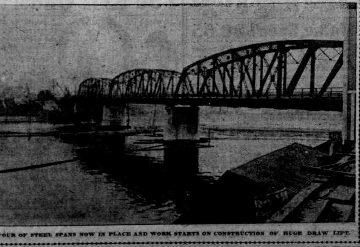
FOUR OF STEEL SPANS NOW IN PLACE AND WORK STARTS ON CONSTRUCTION OF HUGE DRAW LIFT.

PURCHASES AMOUNTING TO $5.00 DELIVERED FREE WITHIN 100 MILES