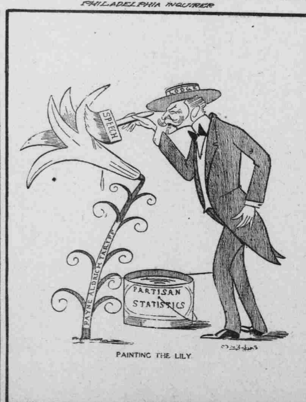
PAINTING THE LILY