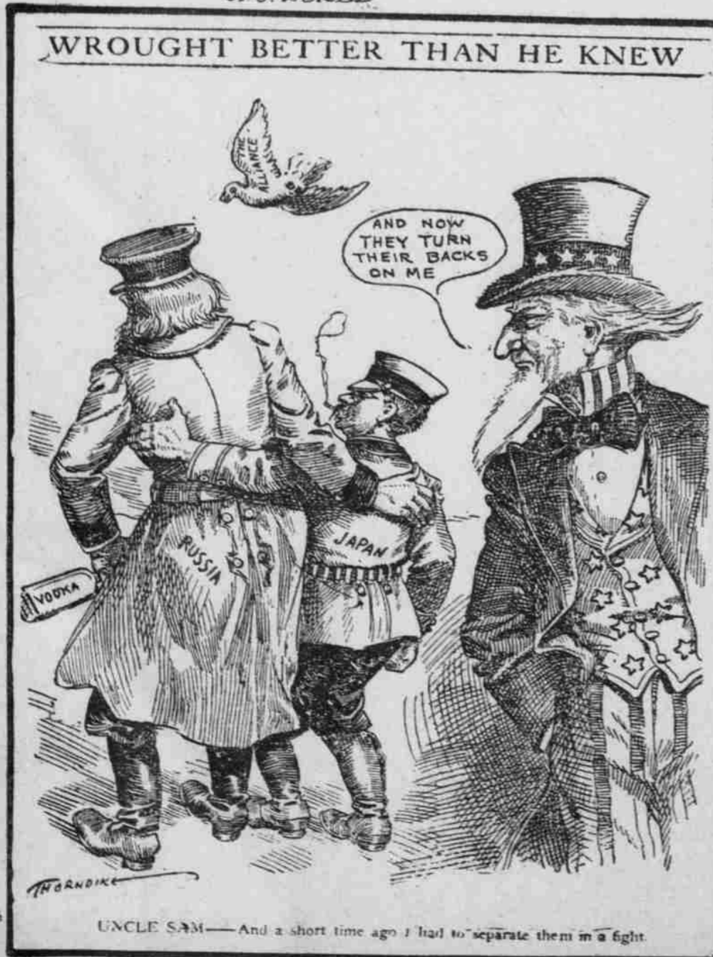
UNCLE SAM—And a short time ago I had to separate them in a fight.